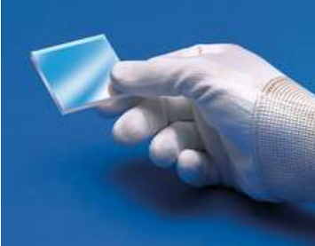
Component Handling Tools

These optics require special handling to avoid damage and ensure long-term performance. Proper handling, cleaning, and storage are essential to maintain optical quality. Explore our Optics Cleaning Resources for step-by-step guides and best practices. For personalized assistance, Email us or Chat with our technical support team.