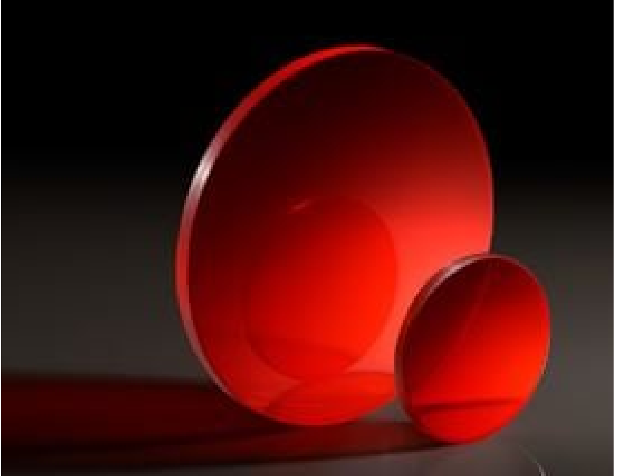
Thallium Bromiodide (KRS-5) Windows