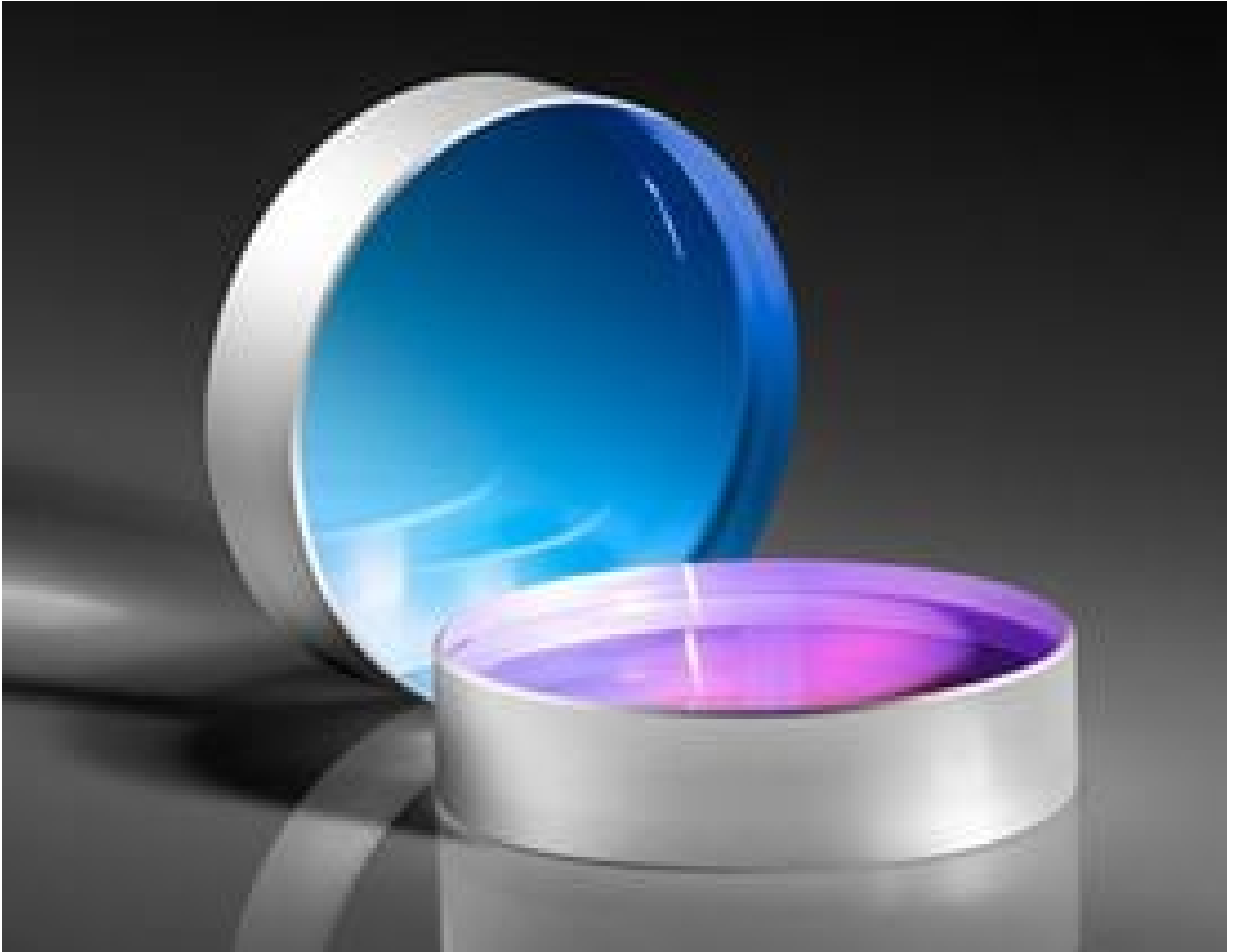
TECHSPEC® Nd:YAG Laser Line Beam Samplers