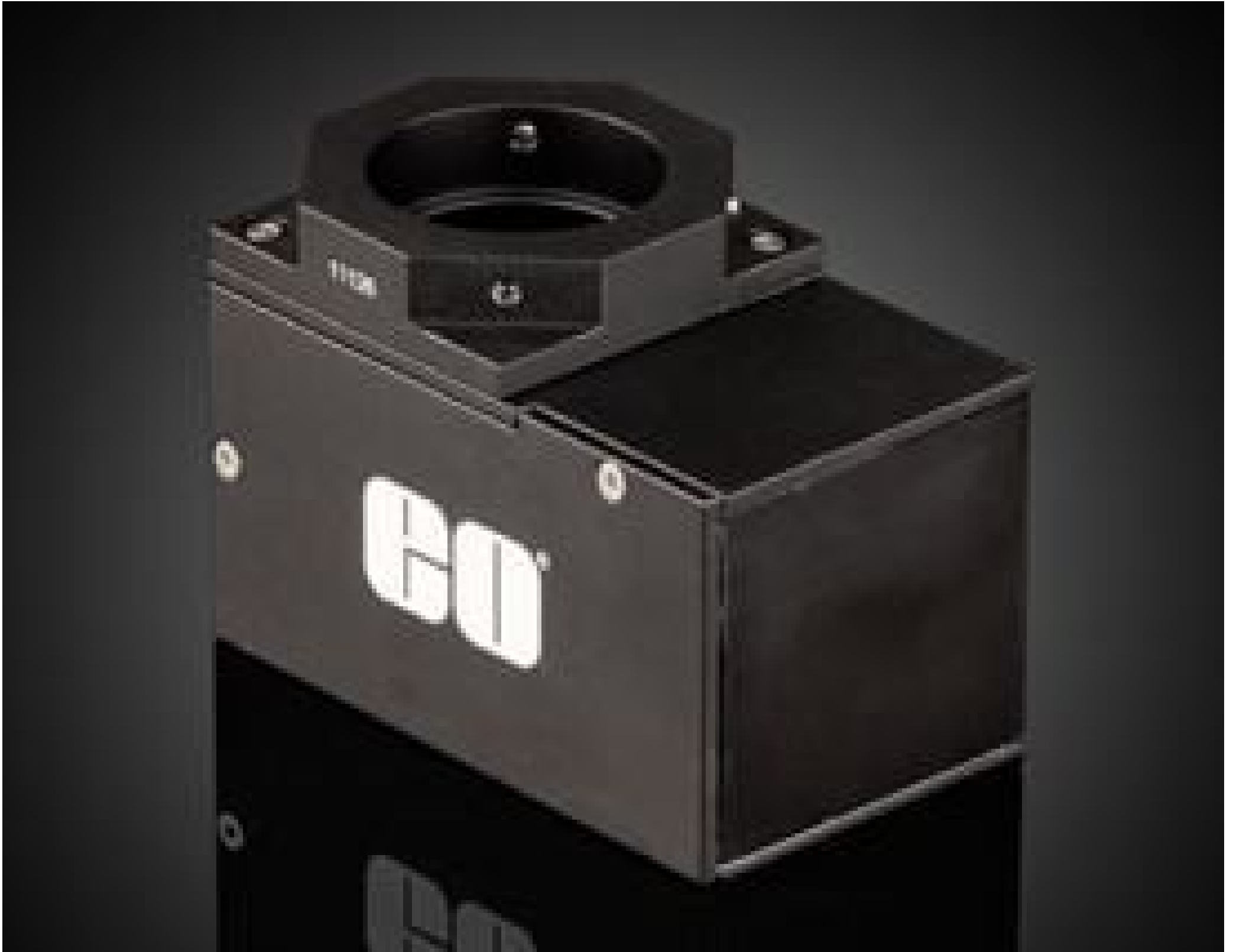
Optical Axis Offset Prism Adapter