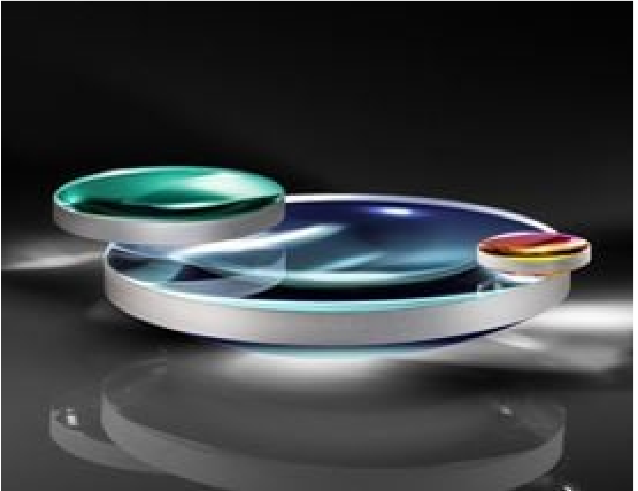
633nm Laser Line Coated Plano-Convex (PCX) Lenses