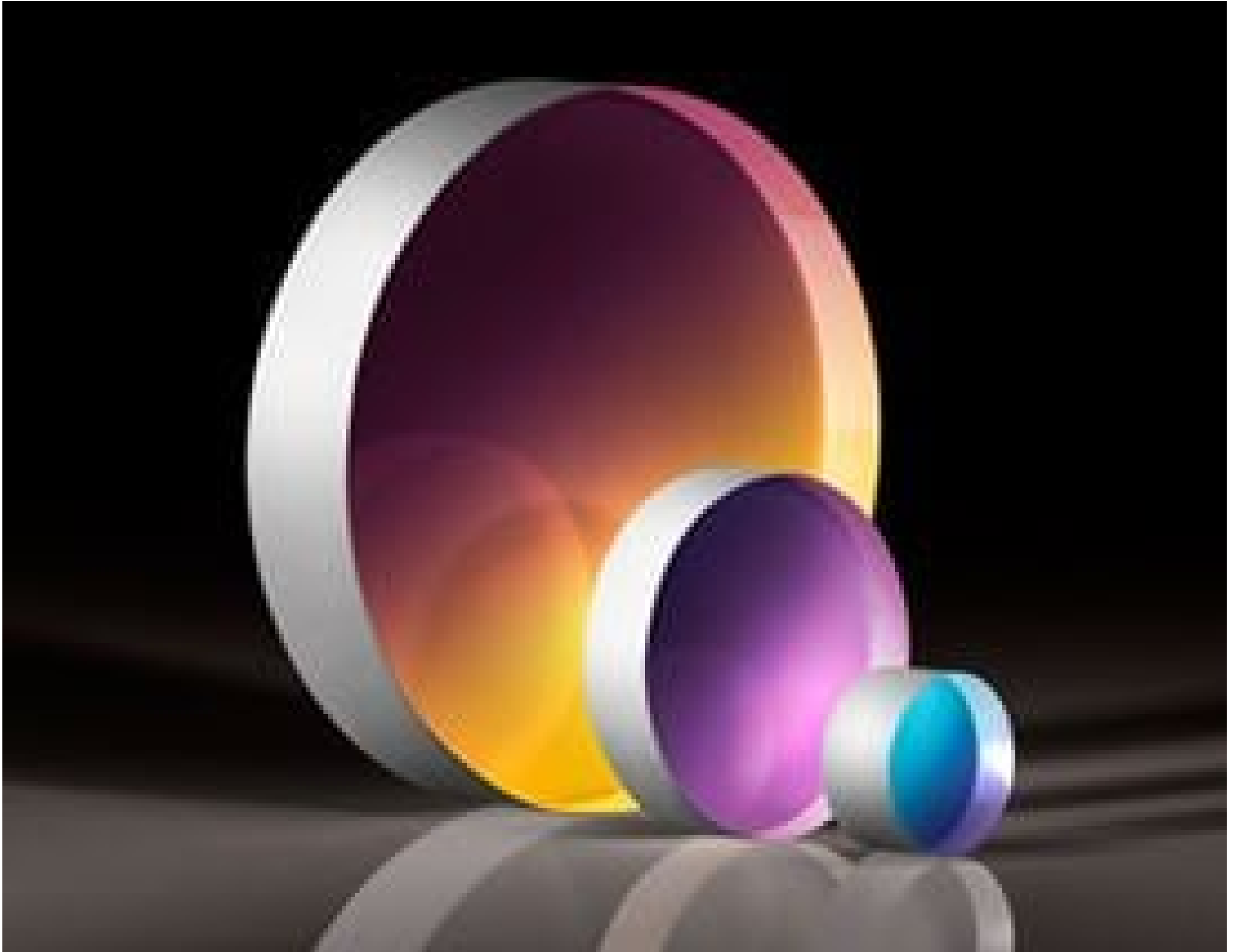
TECHSPEC Excimer Laser Line Mirrors