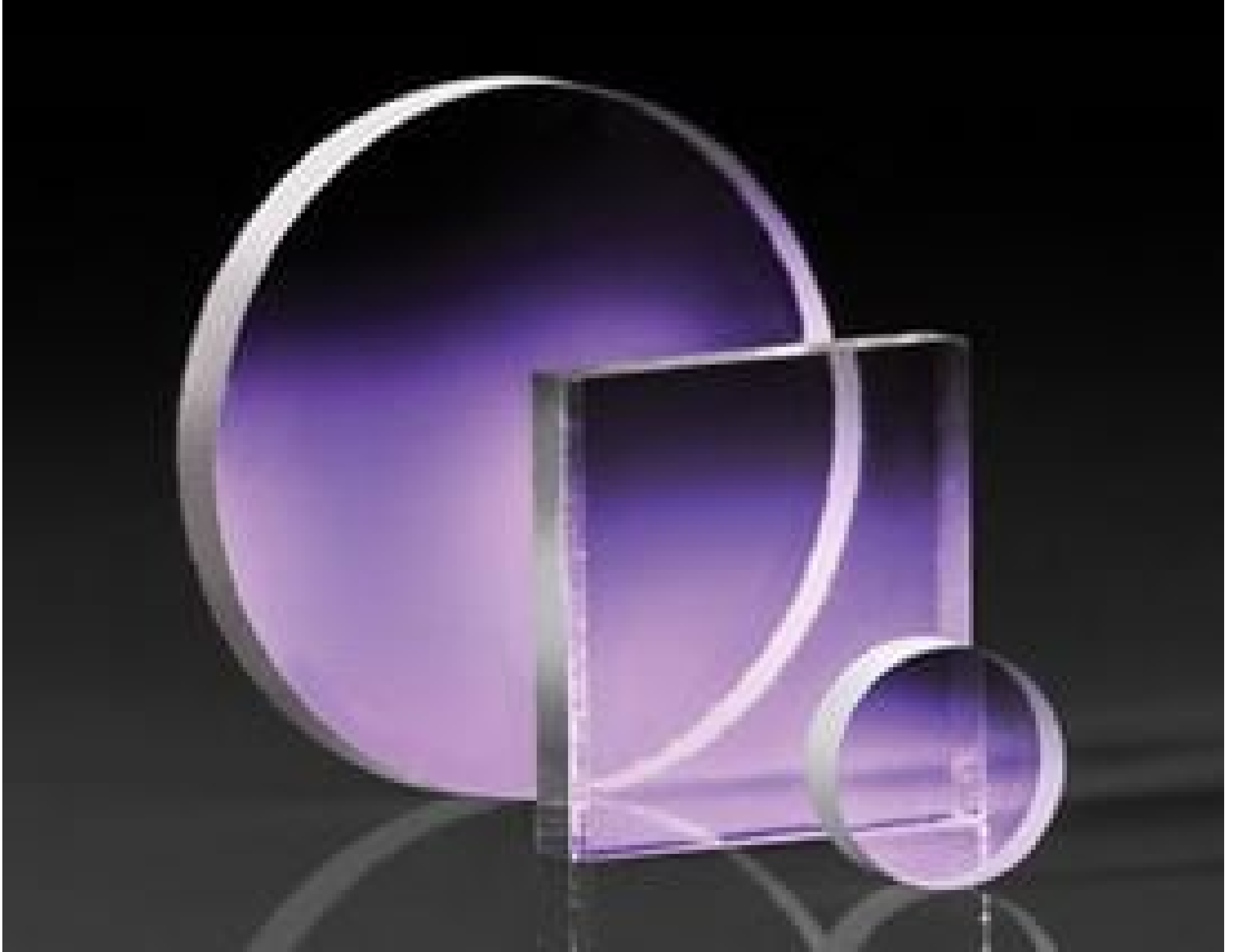
TECHSPEC BOROFLOAT Borosilicate Windows