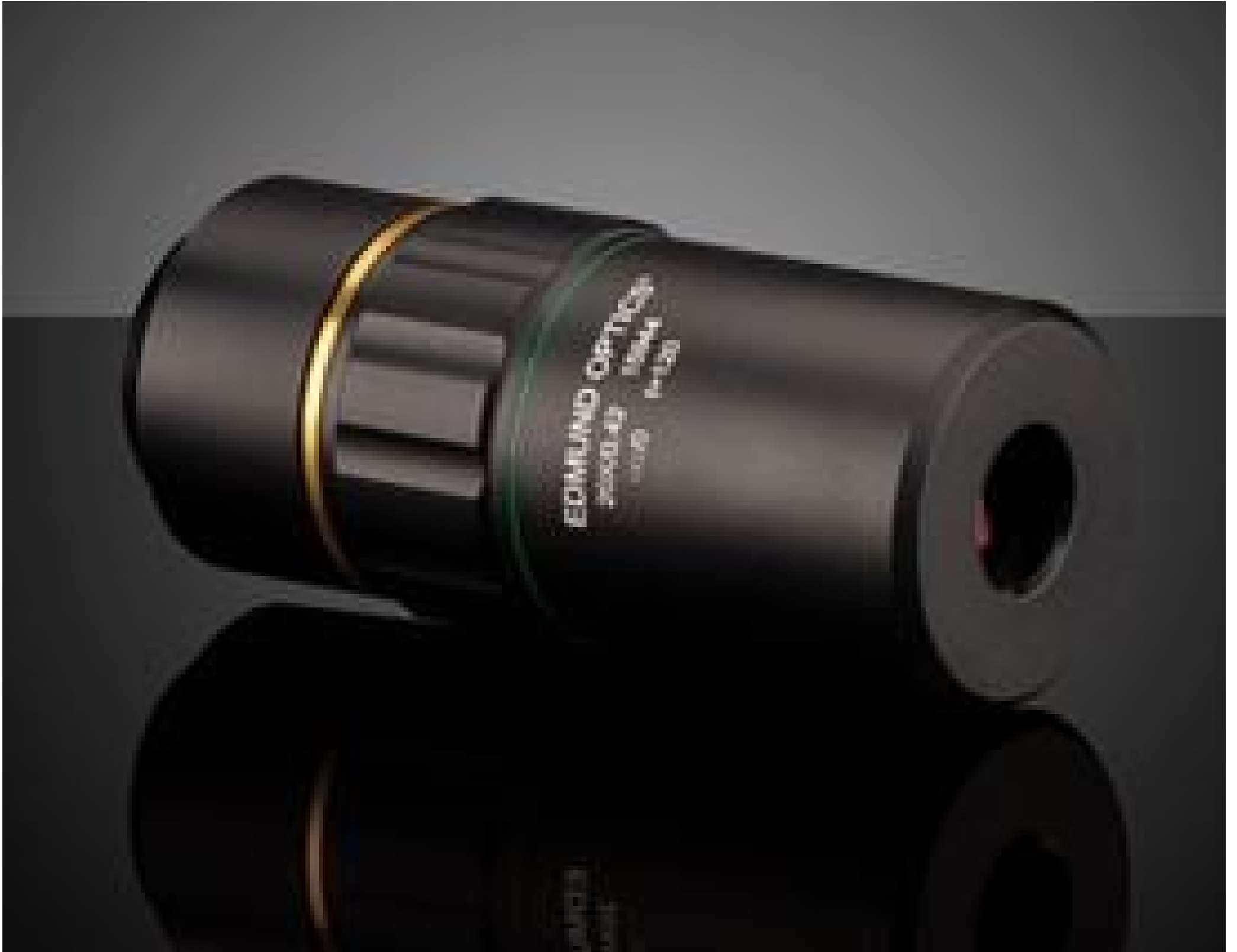
#15-944: 20X 120i Infinity Corrected Objective