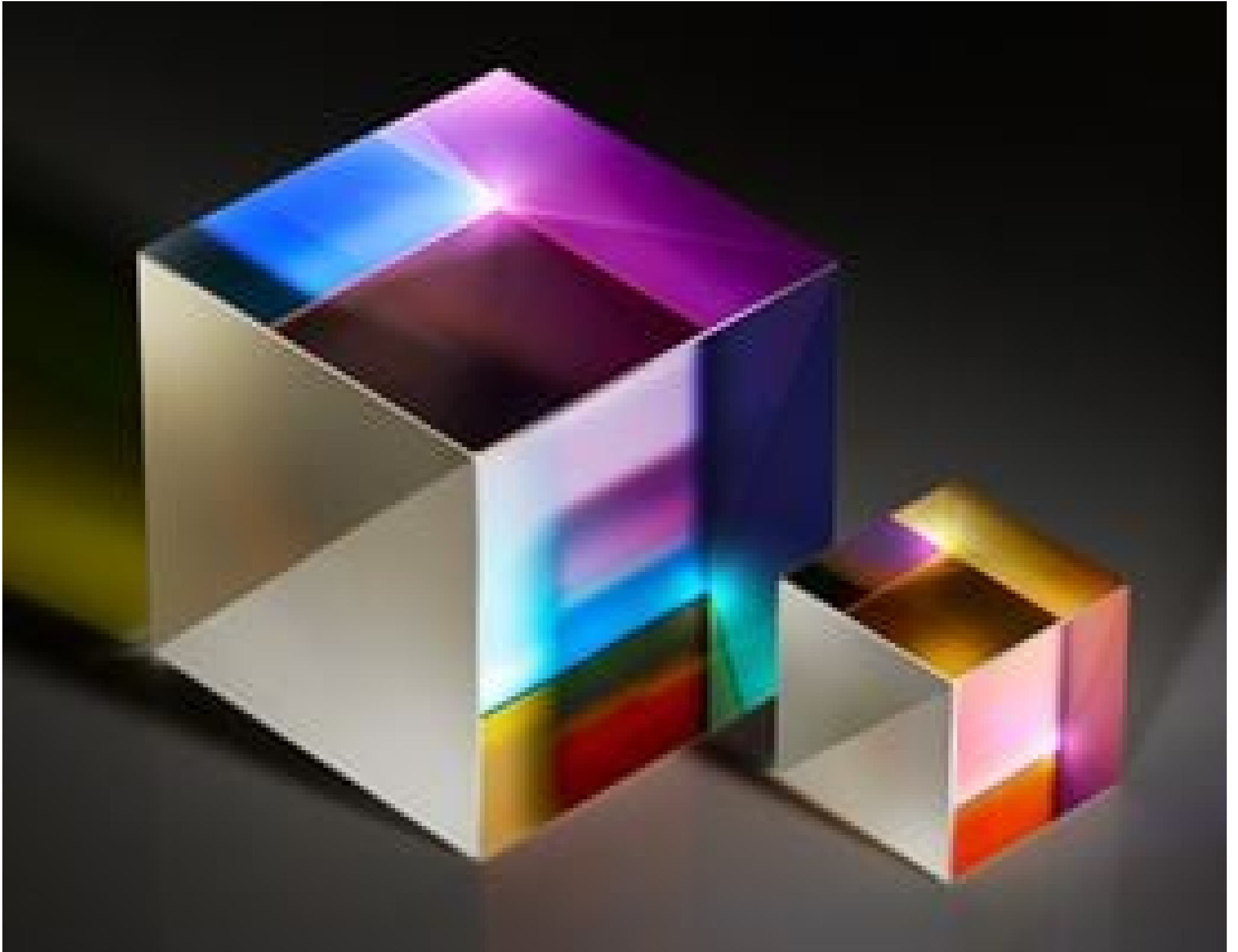
TECHSPEC® Broadband Polarizing Cube Beamsplitters