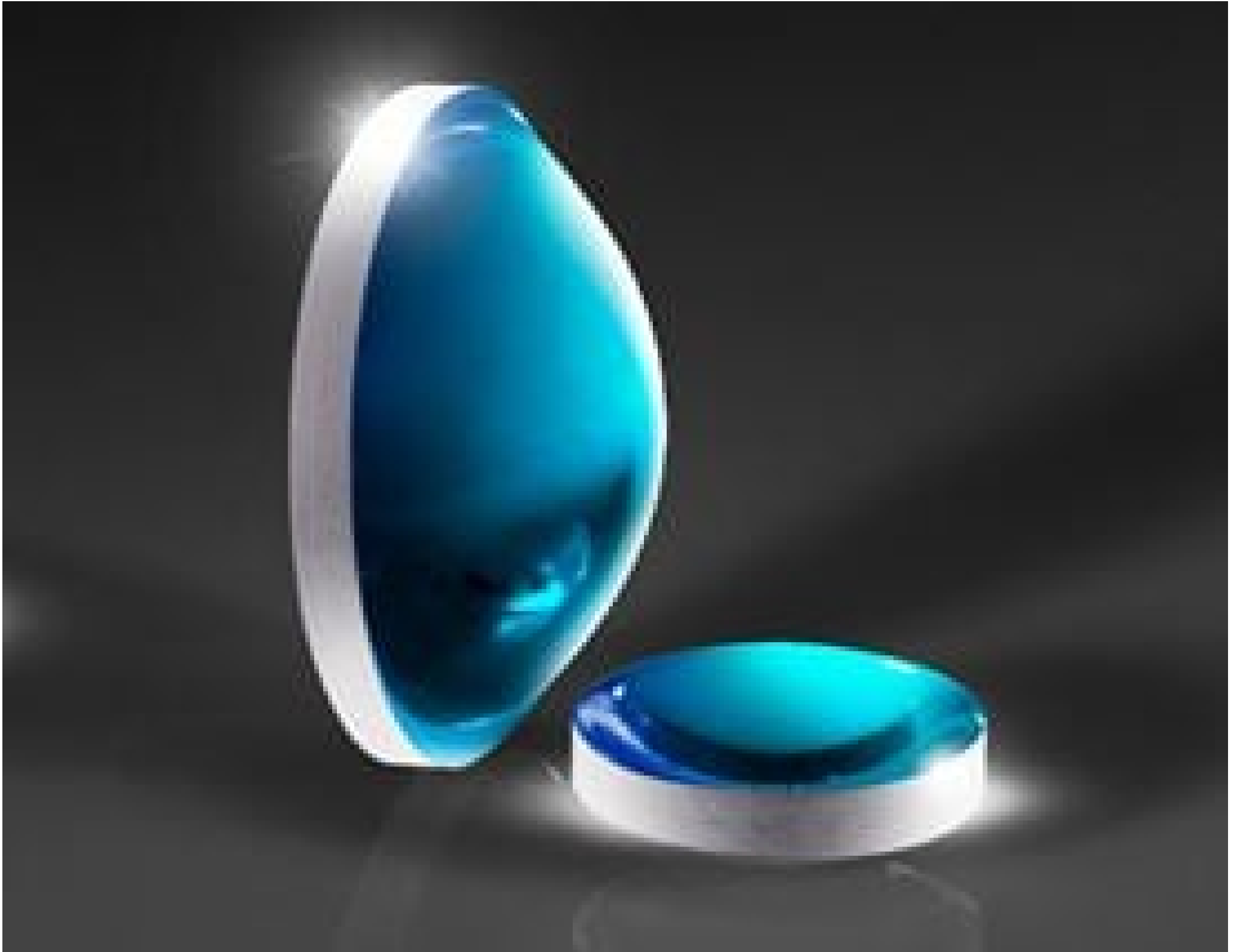
Molded Aspheric Condenser Lenses