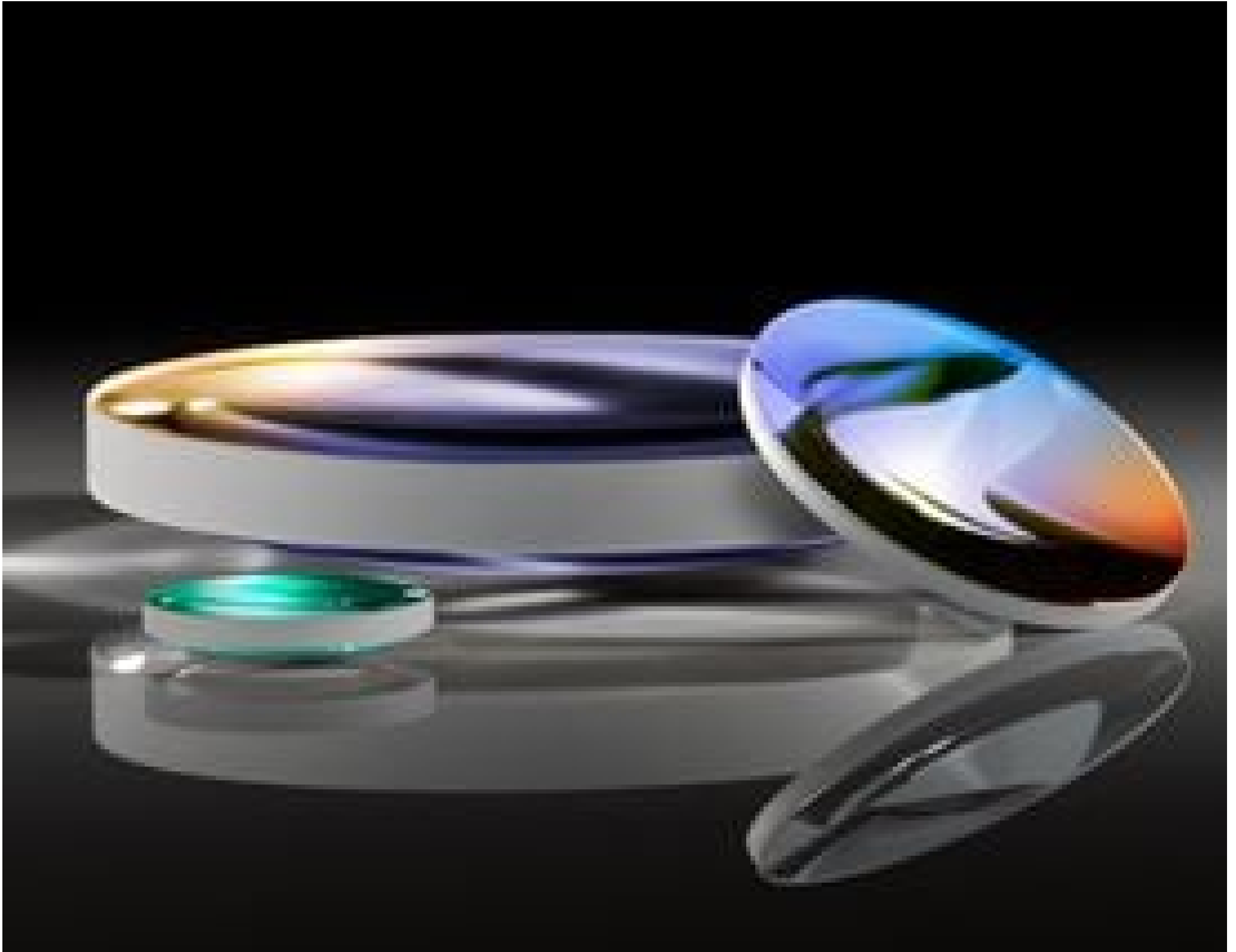
YAG-BBAR Coated Plano-Convex (PCX) Lenses