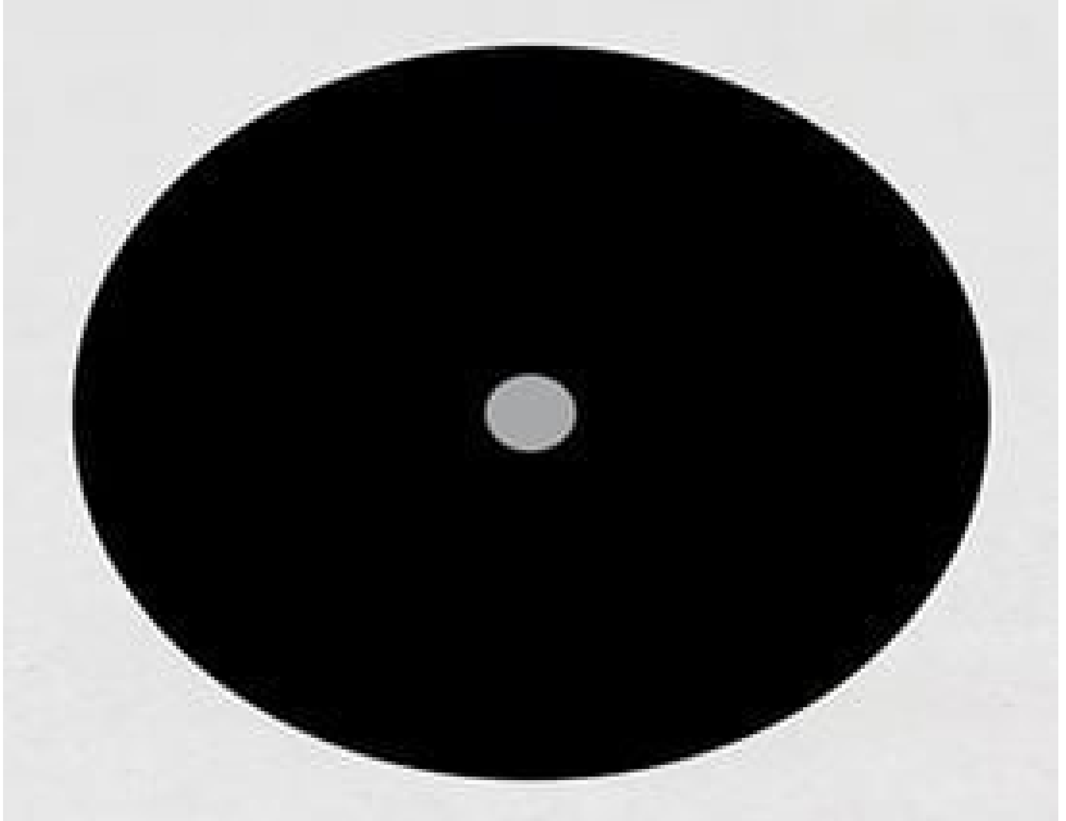
Acktar Blackened Pinholes (unmounted)