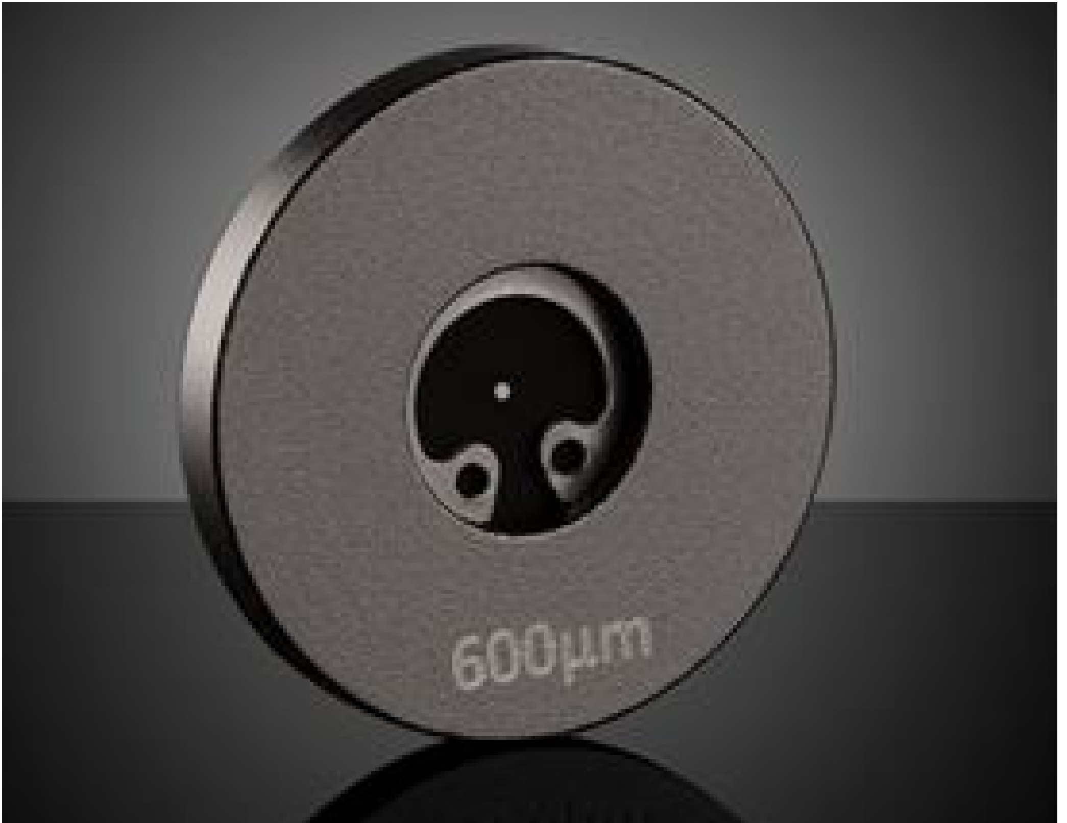
Acktar Blackened Pinholes (mounted)