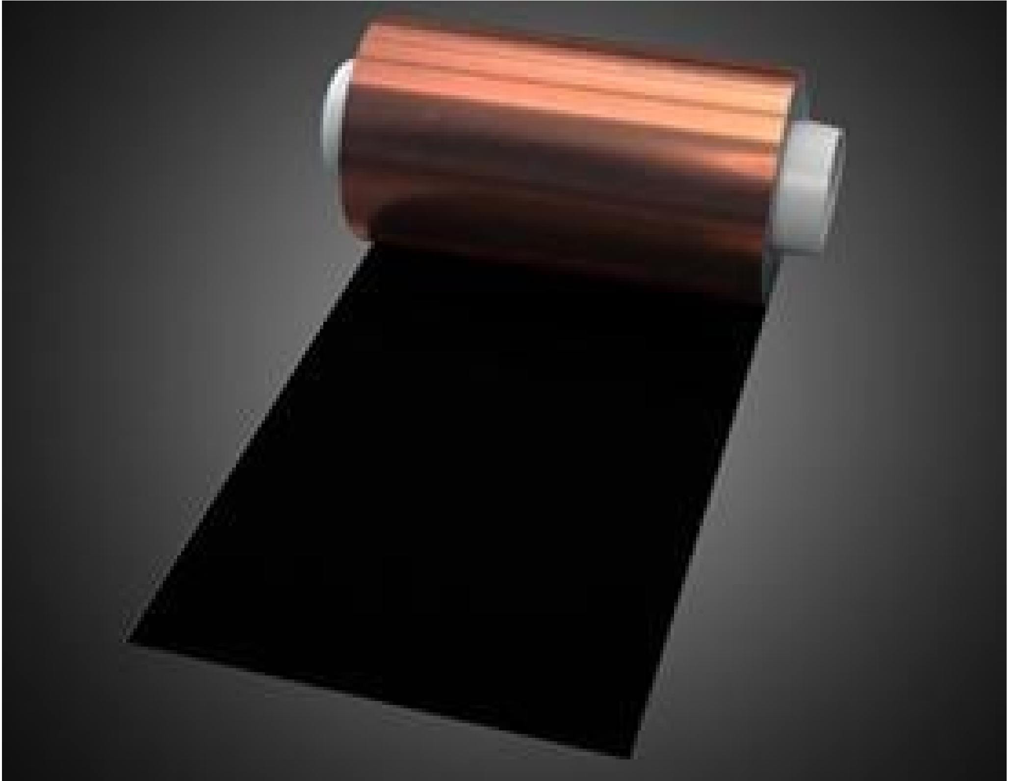
Roll of MaxiBlack