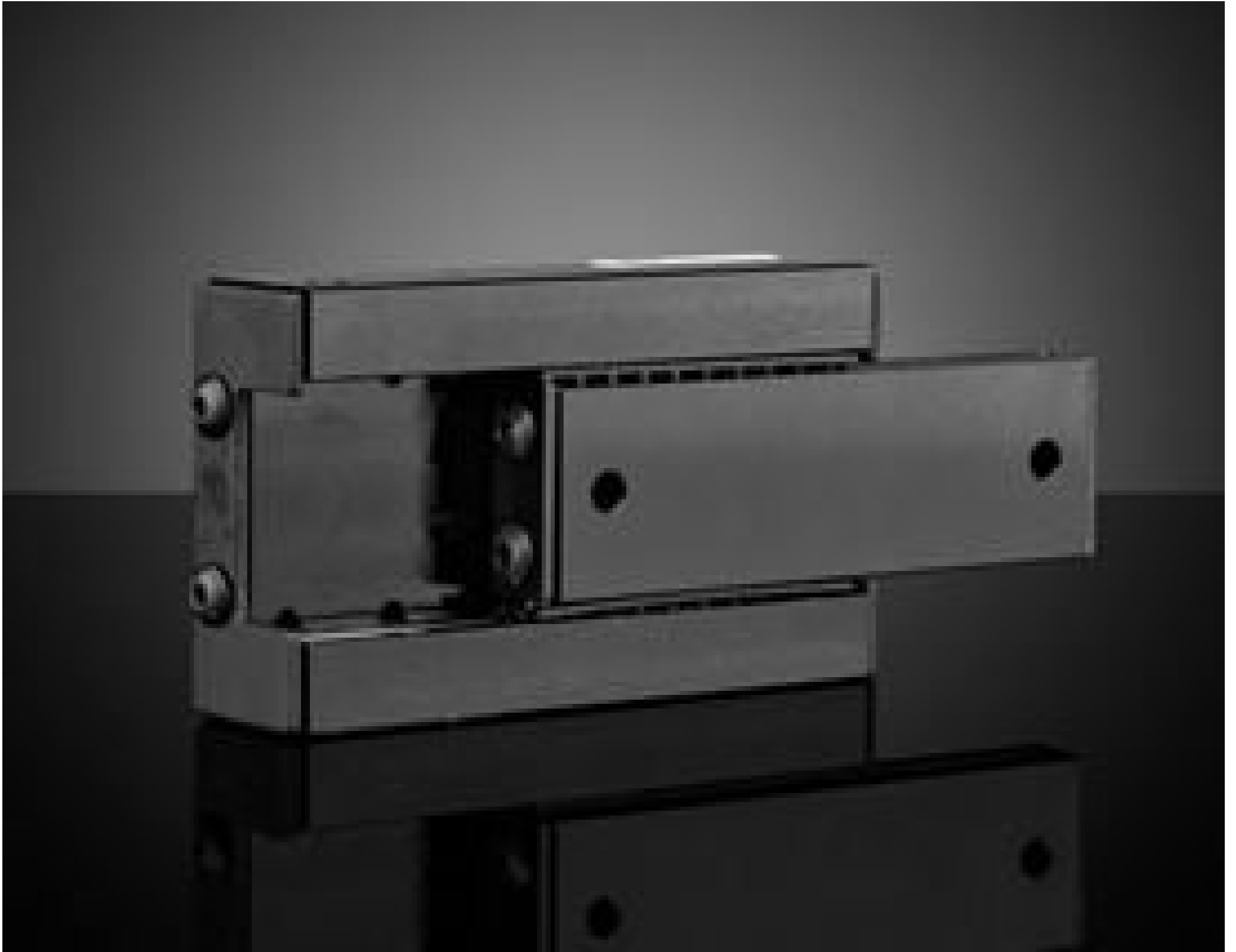
2" Travel, 3"L x 1.75"W Ball Bearing Slide, #37-361