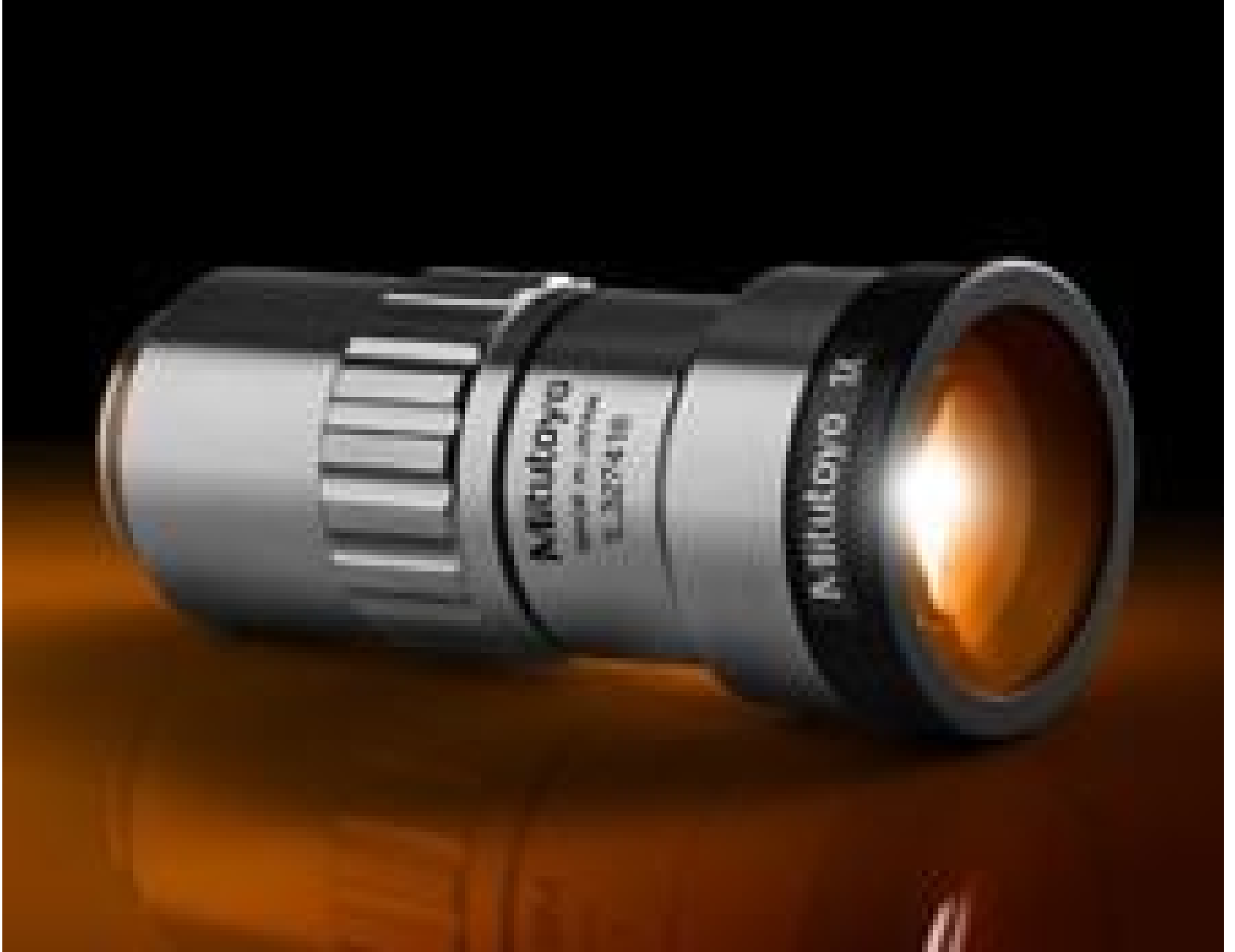
1X Mitutoyo Plan Apo Infinity Corrected Long WD Objective, #58-235