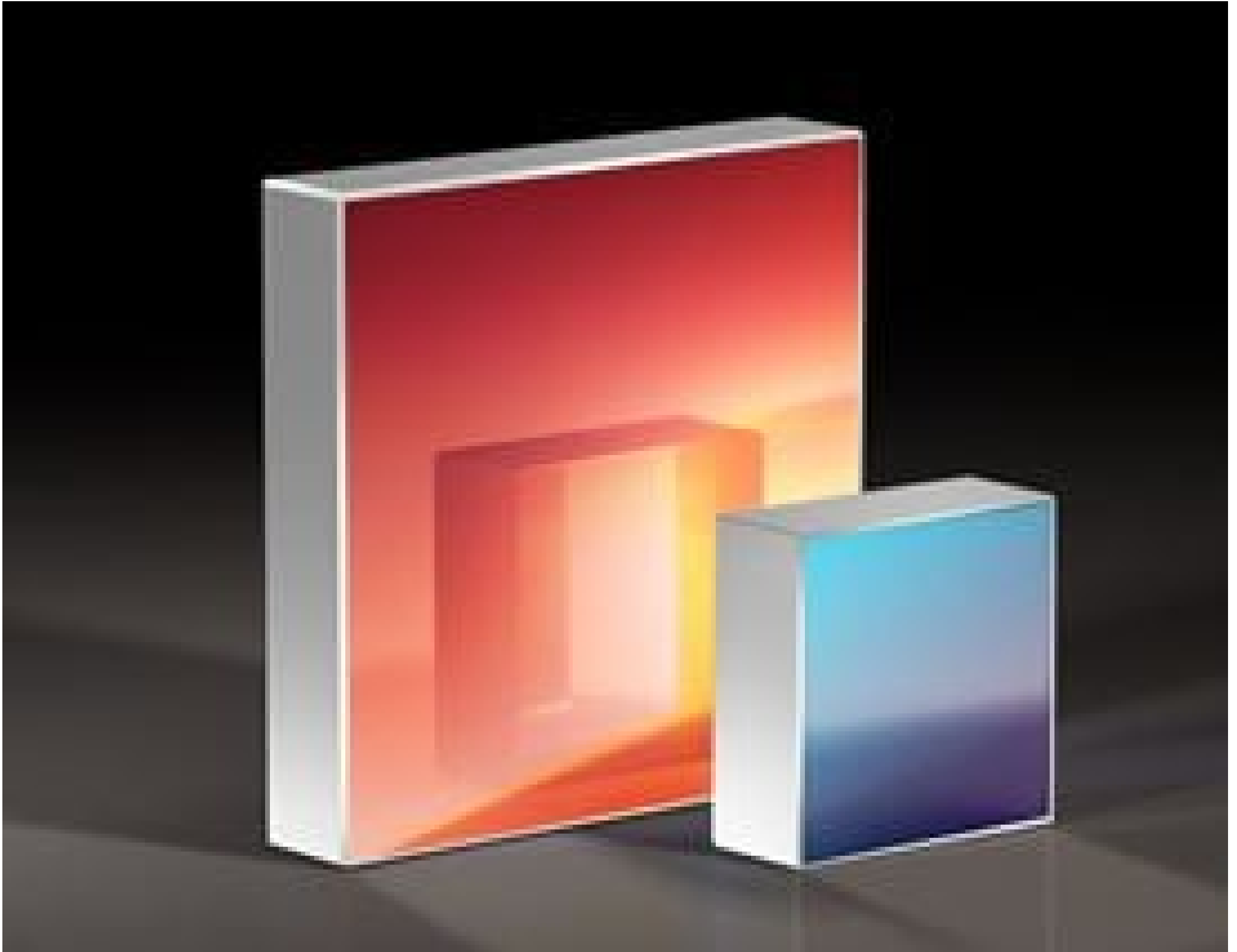
Reflective Holographic Gratings