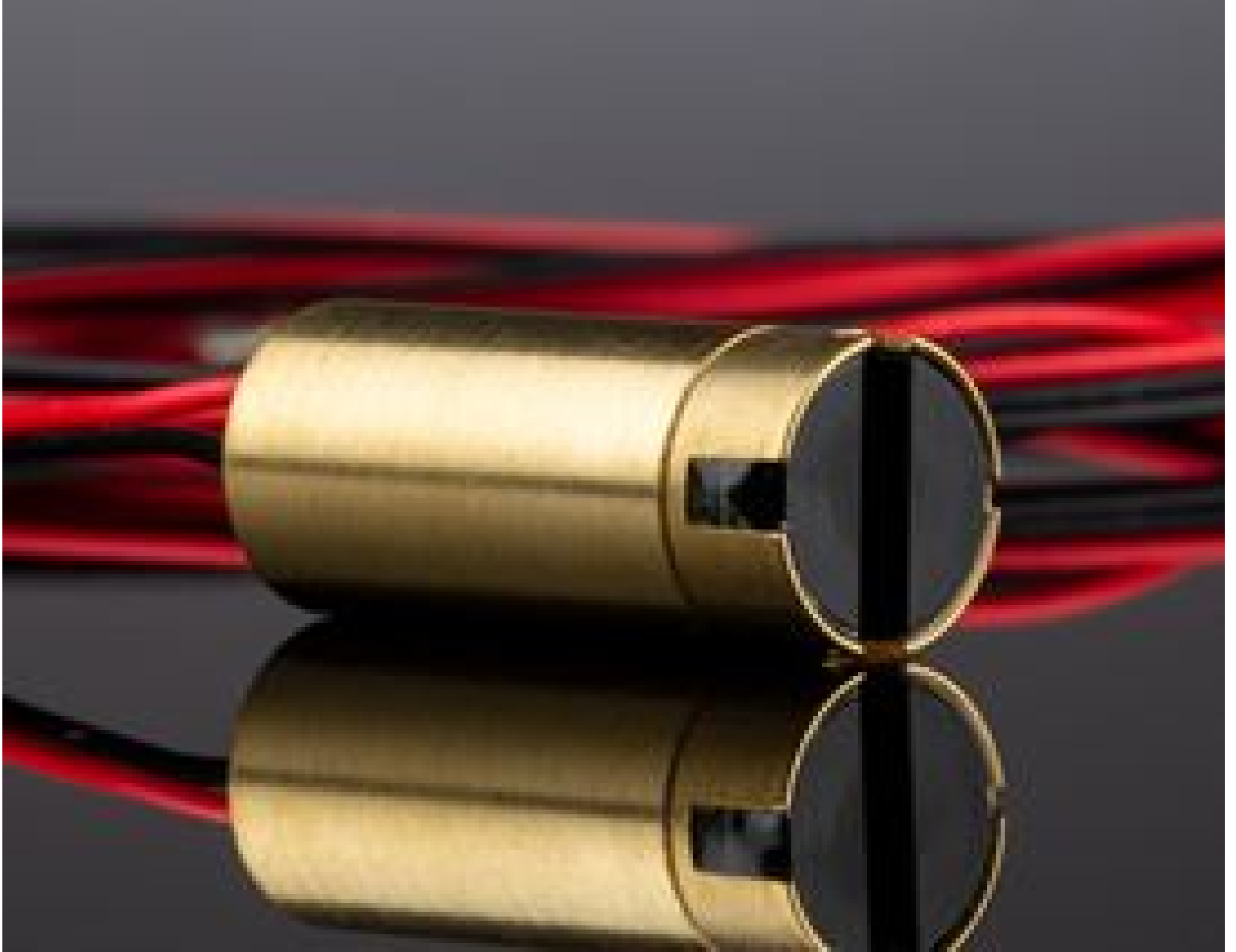
Coherent® Micro VLM™ Laser Diode - Line Option