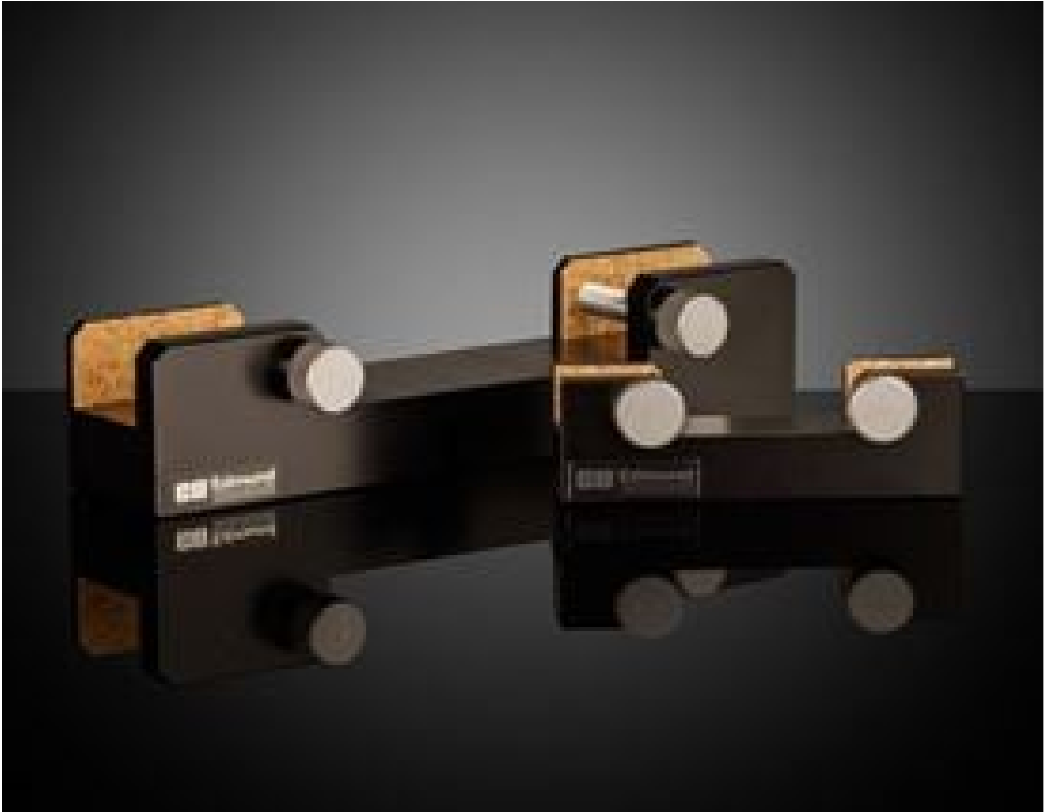
Fixed Filter Mounts