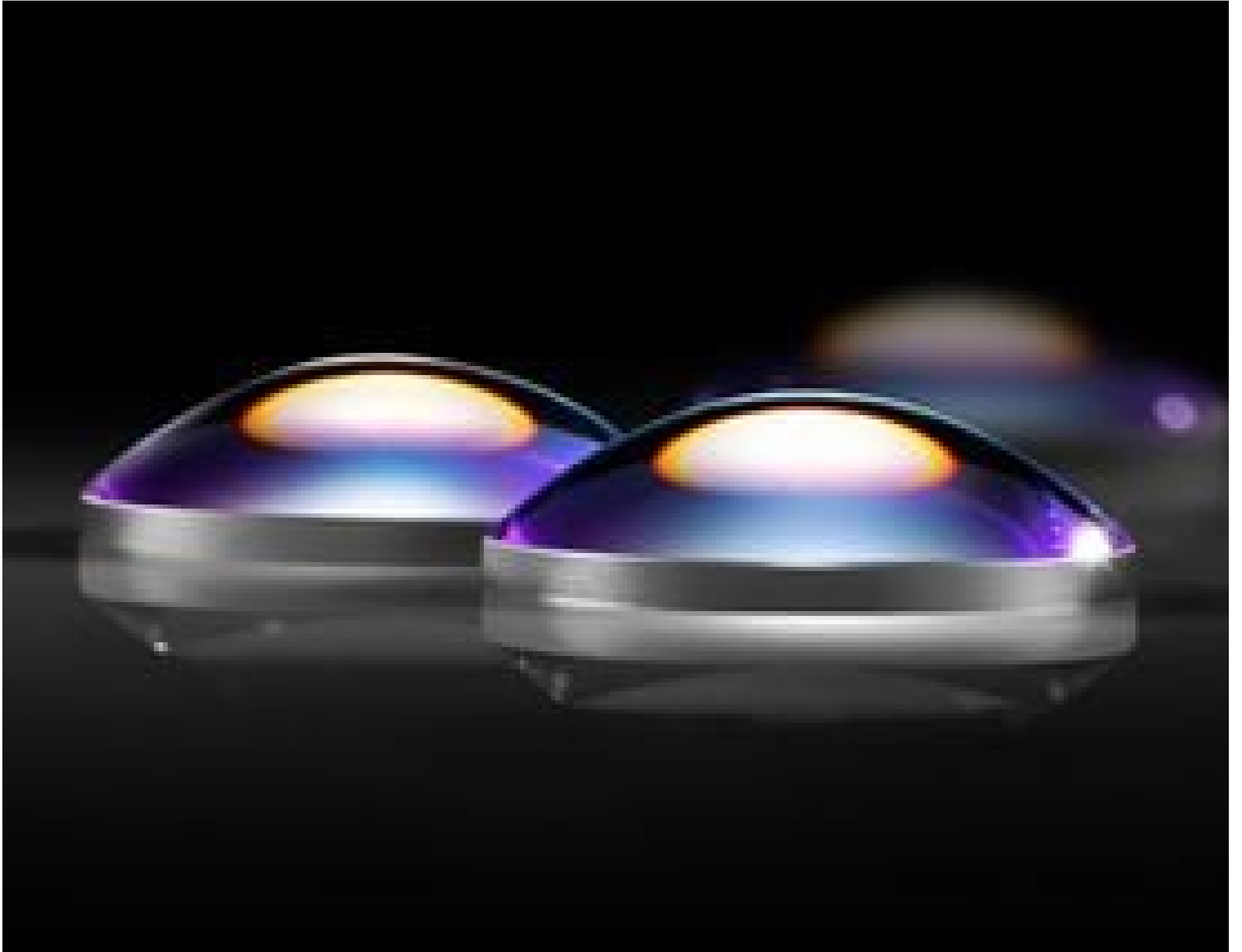
TECHSPEC® Precision Molded Aspheric Lenses