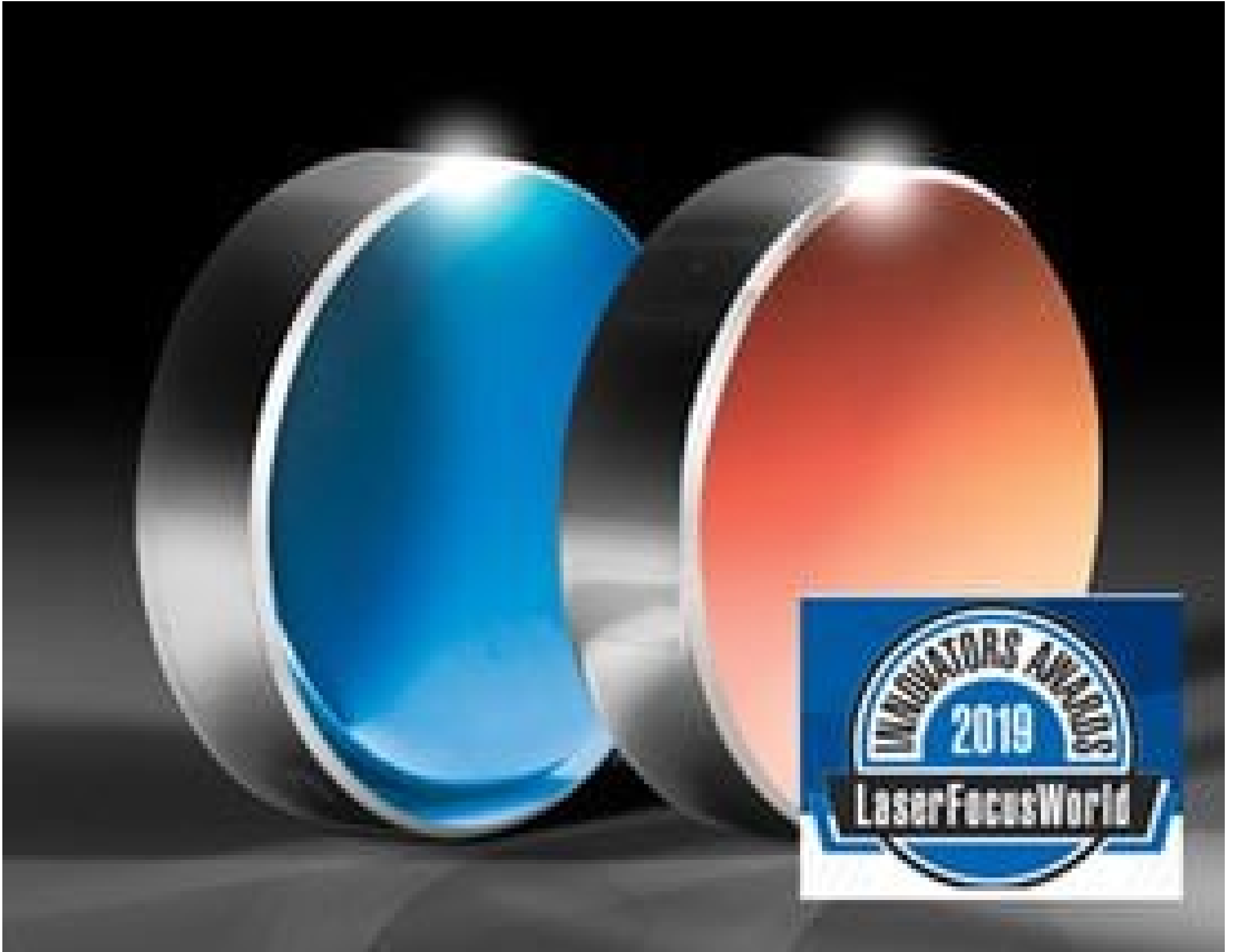
Extreme Ultraviolet (EUV) Flat Mirrors