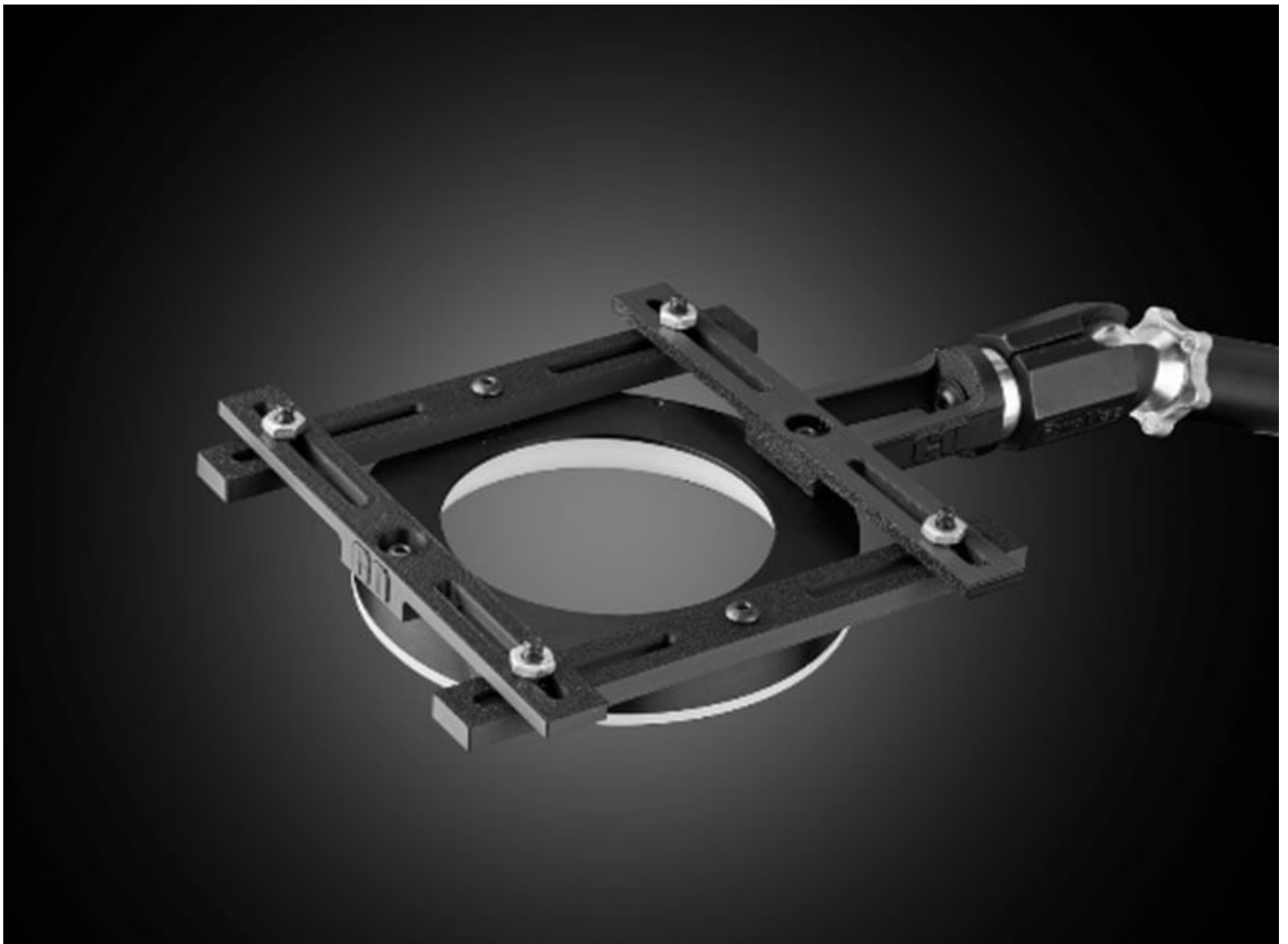
Ring Light Configuration