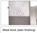
Metal block (stain finishing)