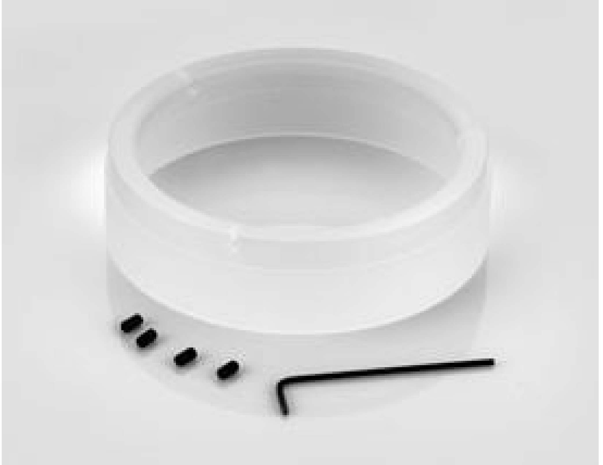
Ring Diffusion Plate