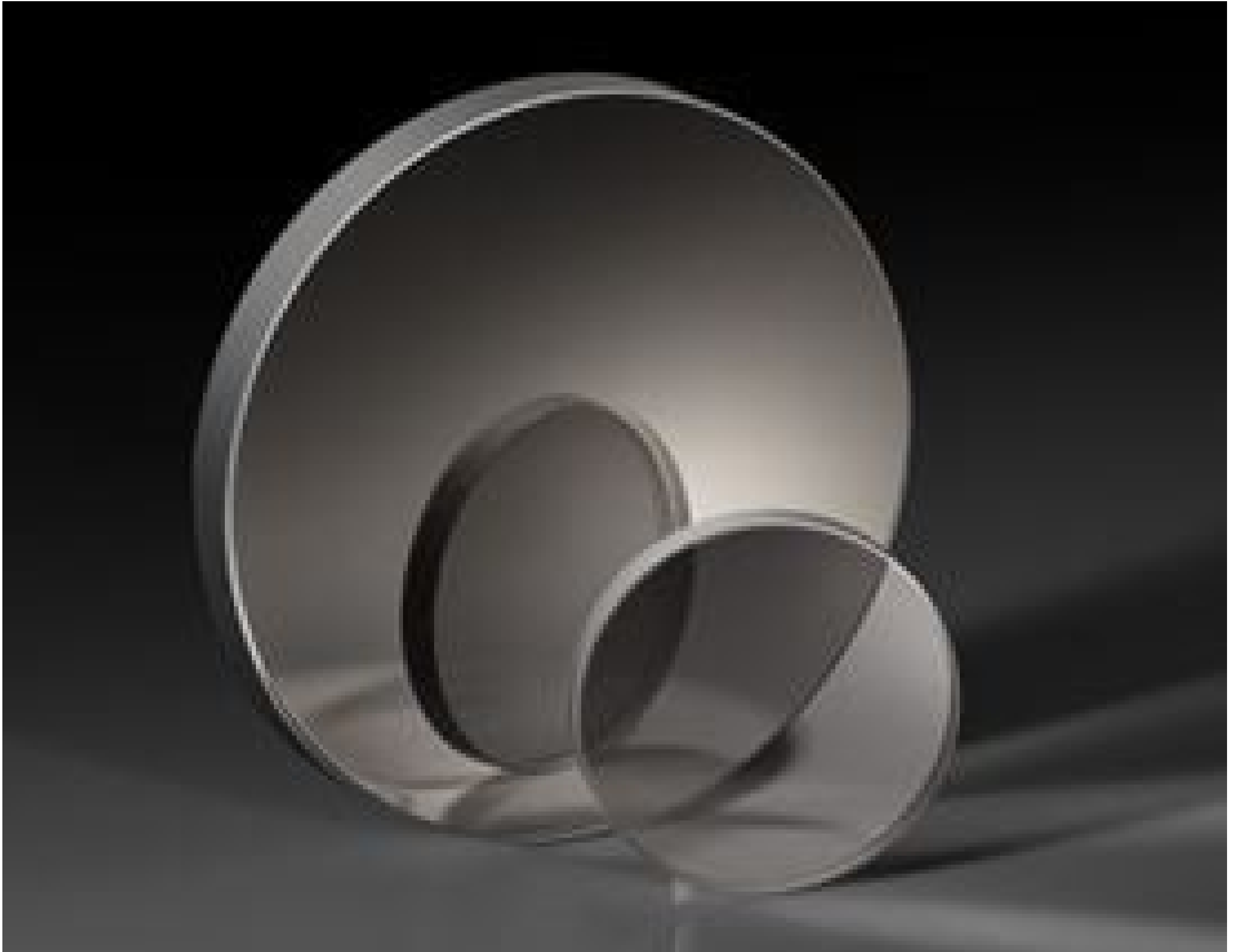
Near-IR (NIR) Neutral Density (ND) Filters