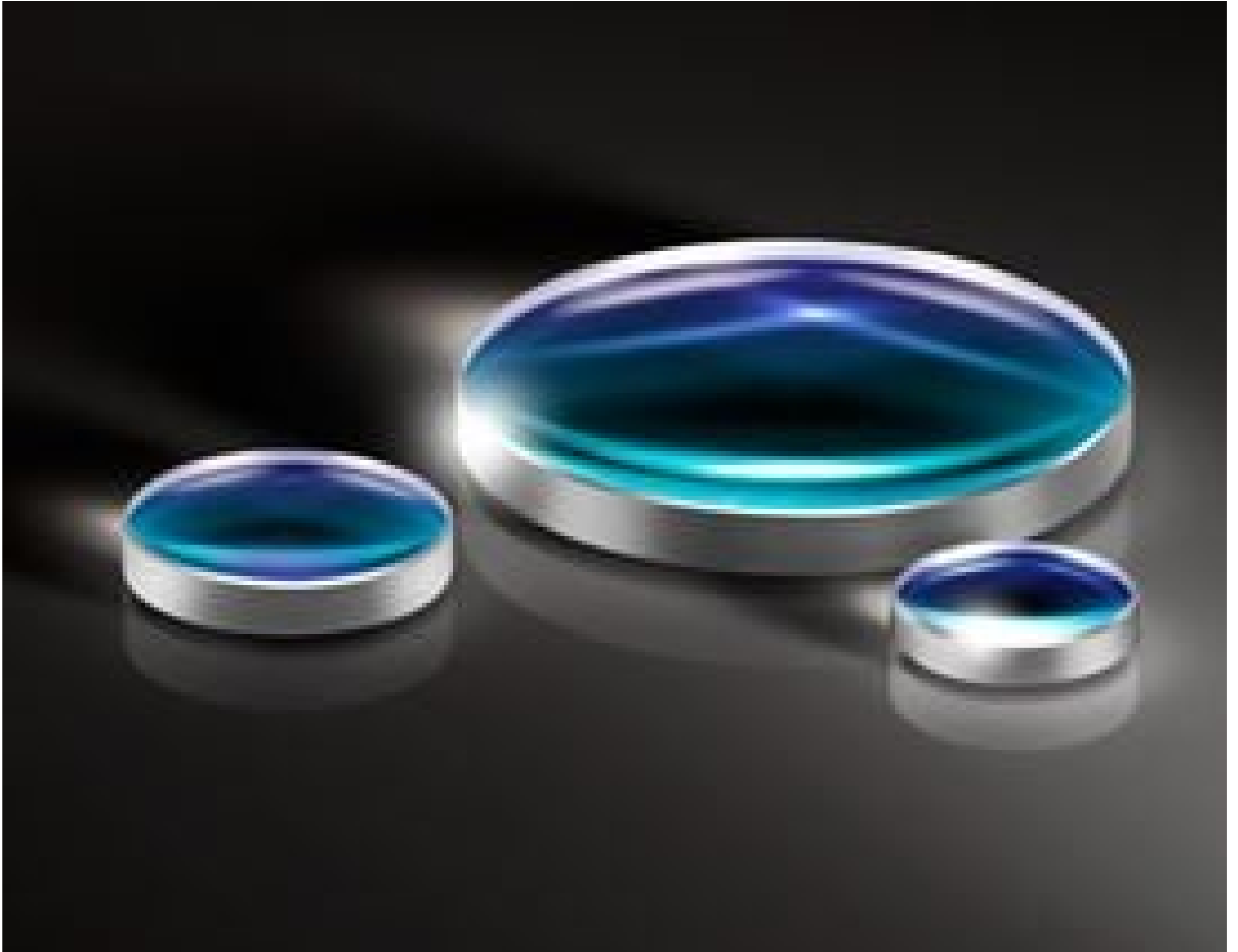
UV Fused Silica Double-Convex (DCX) Lenses