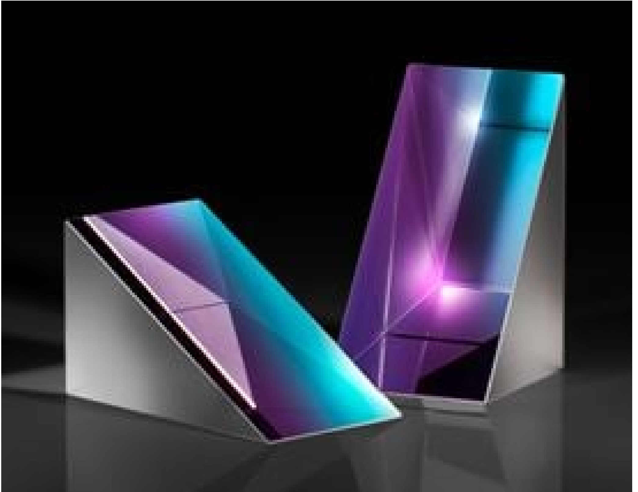
30° - 60° - 90° Littrow Dispersion Prisms