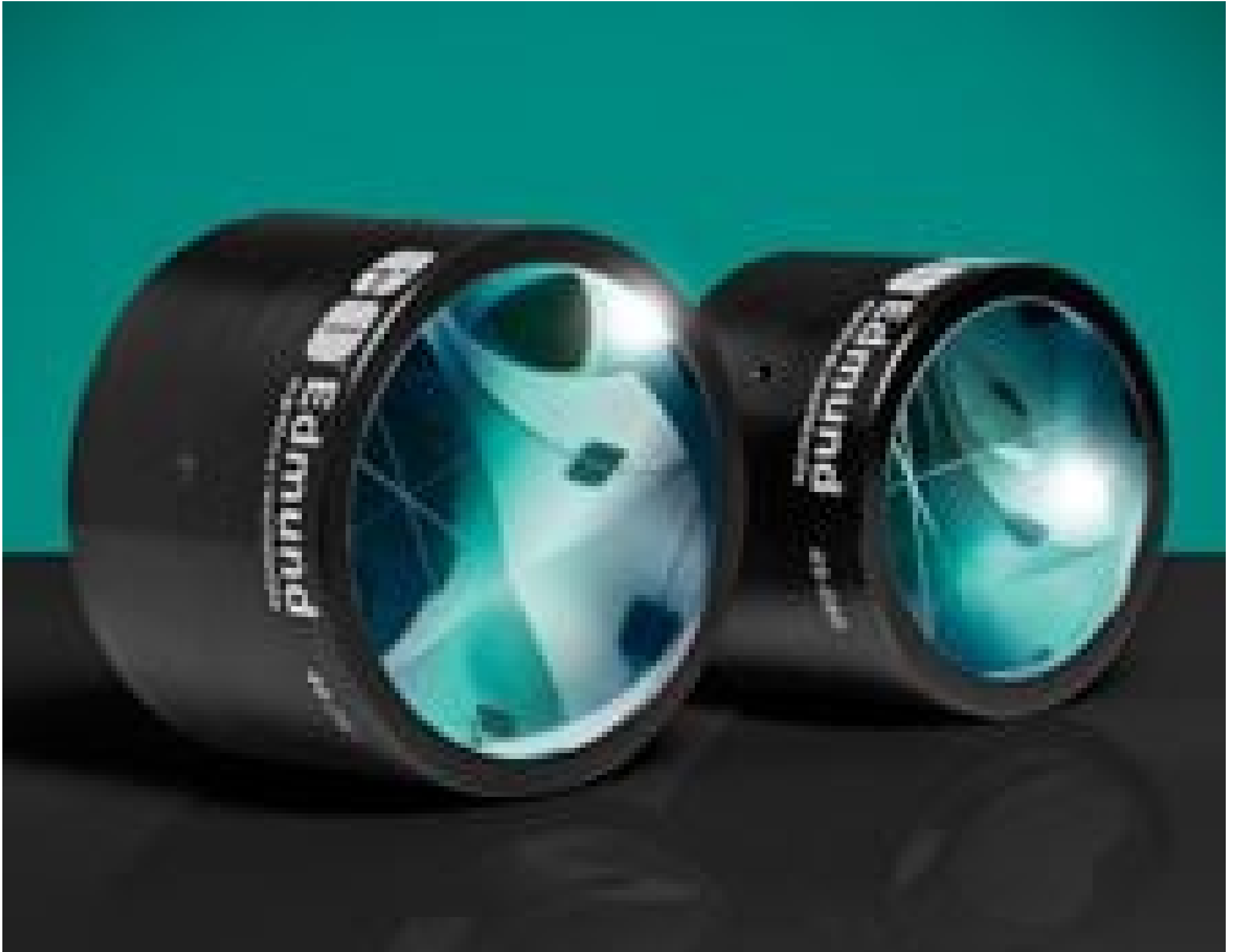
Mounted N-BK7 Corner Cube Retroreflectors