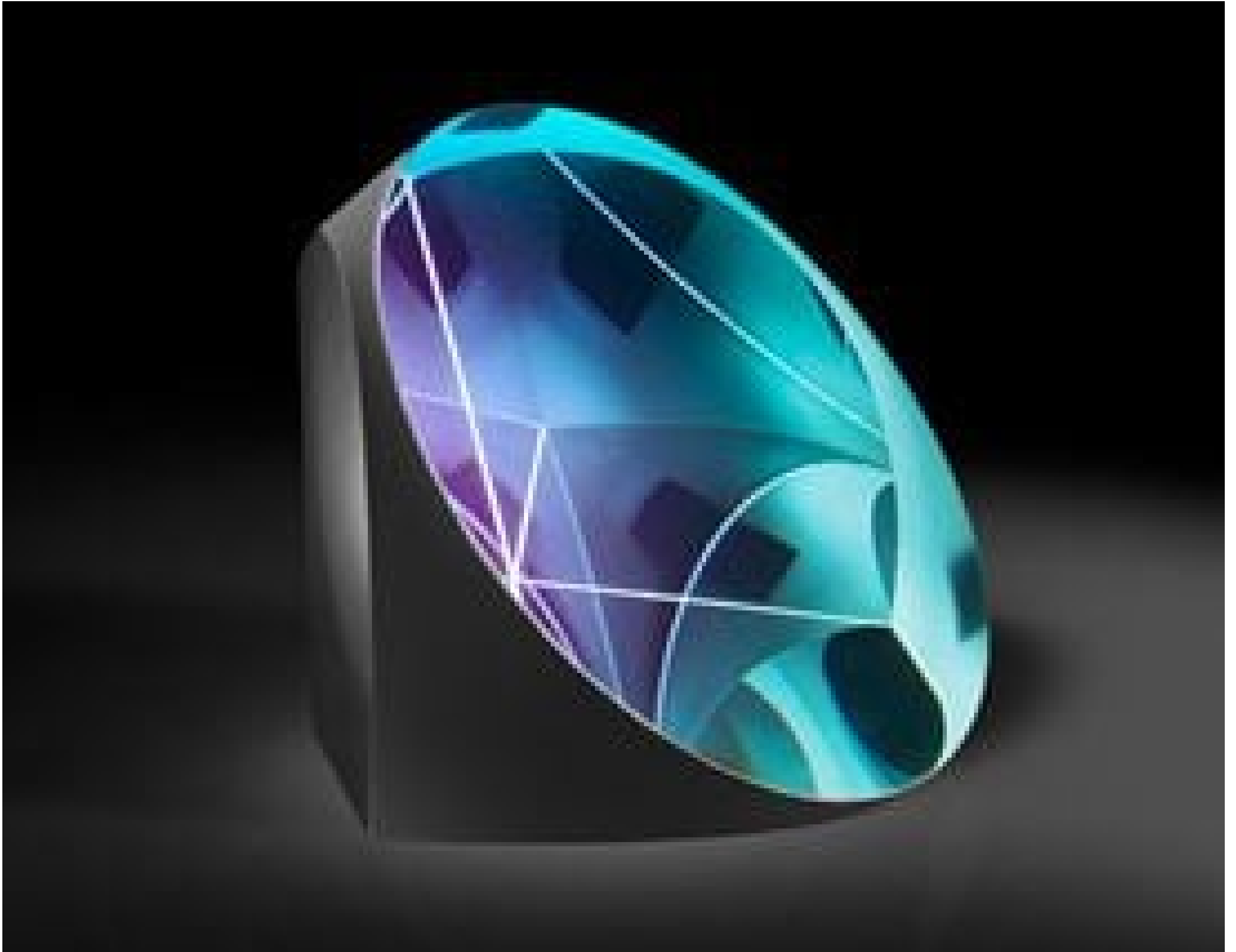
N-BK7 Corner Cube Retroreflectors with Black Overpaint