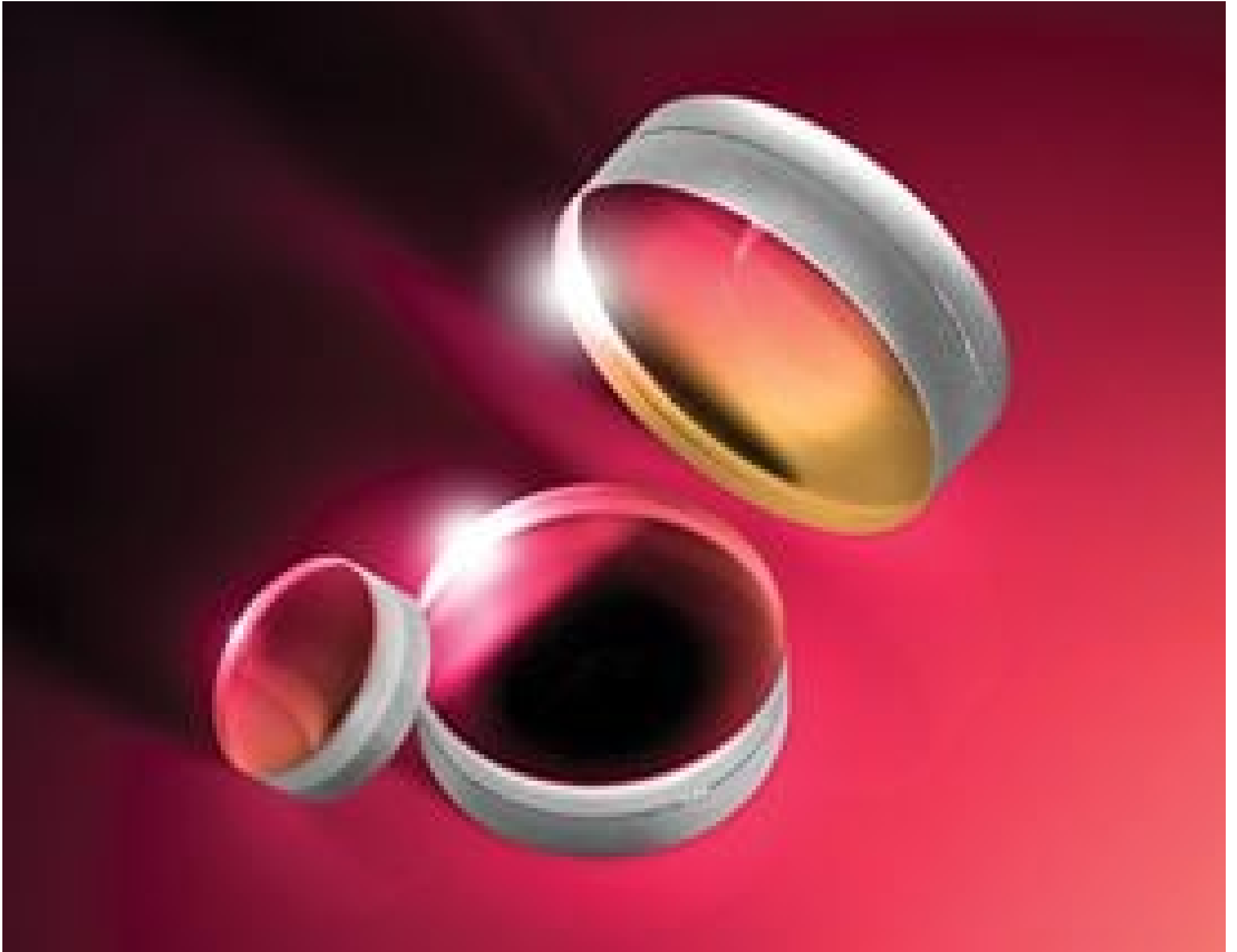
YAG-BBAR Coated Achromatic Lenses