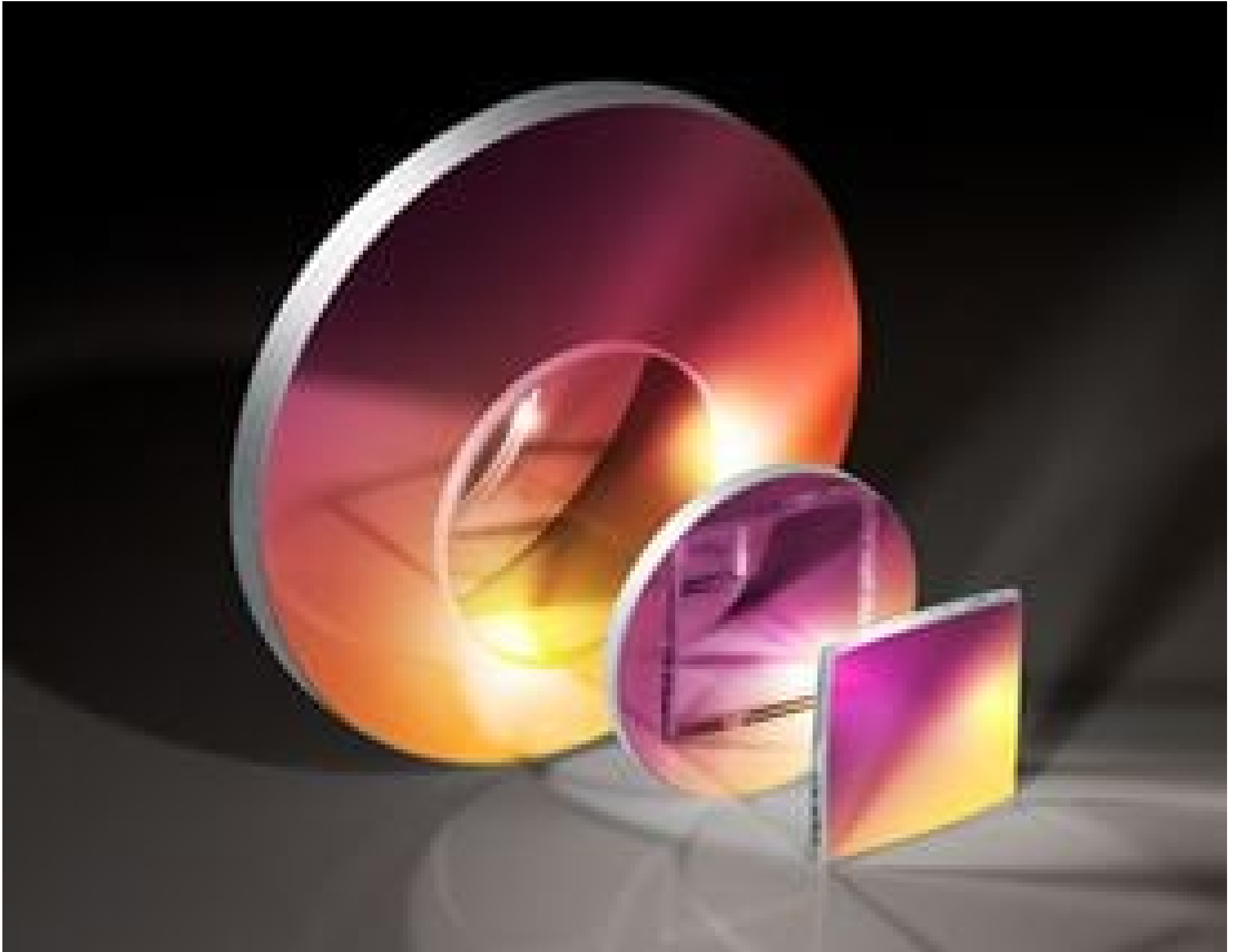
4-6λ First Surface Mirrors