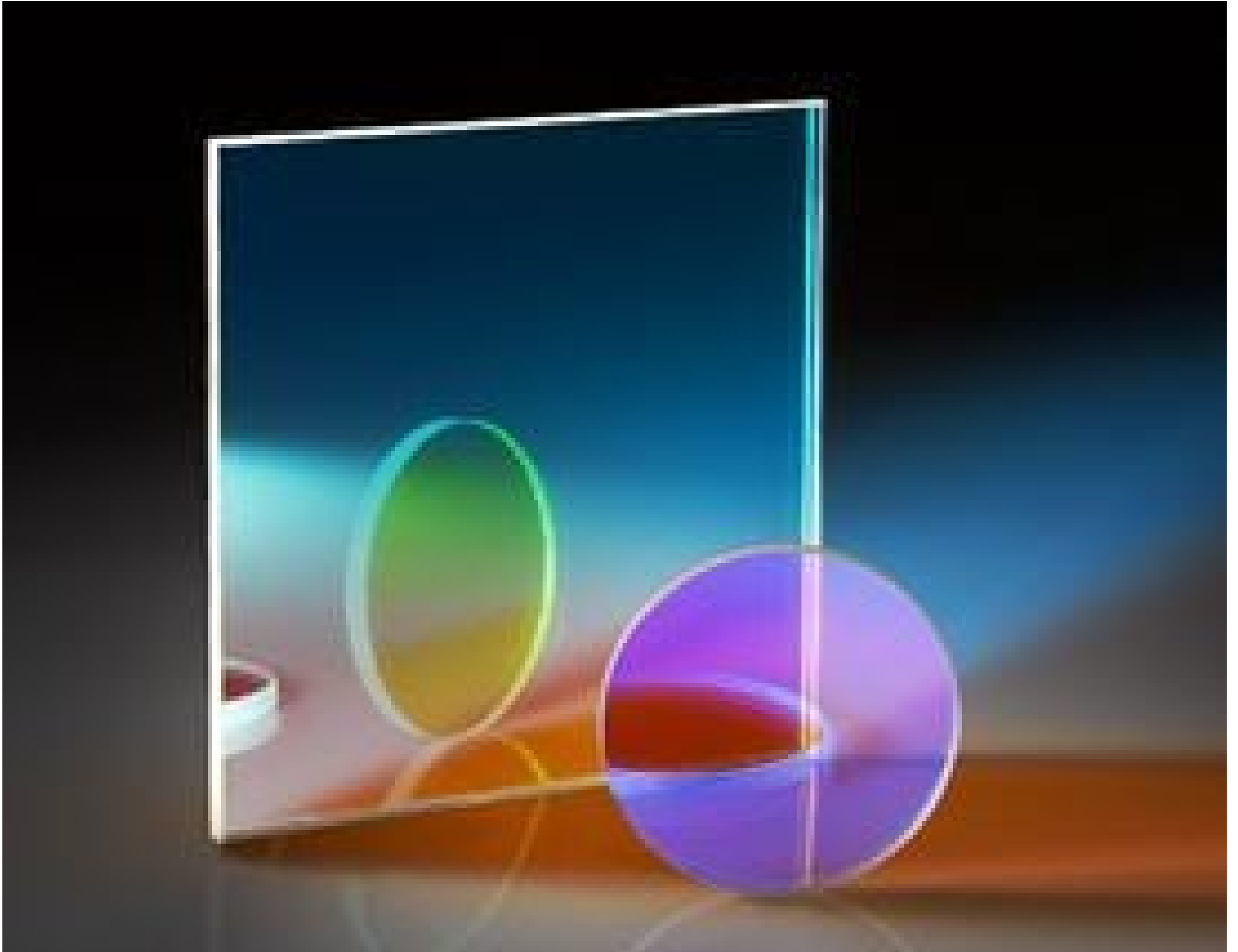
Additive and Subtractive Dichroic Color Filters