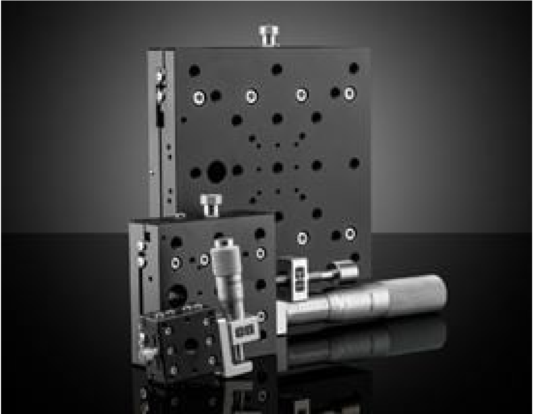
TECHSPEC® Crossed-Roller Bearing Linear Translation Stages (Standard-Top Model)