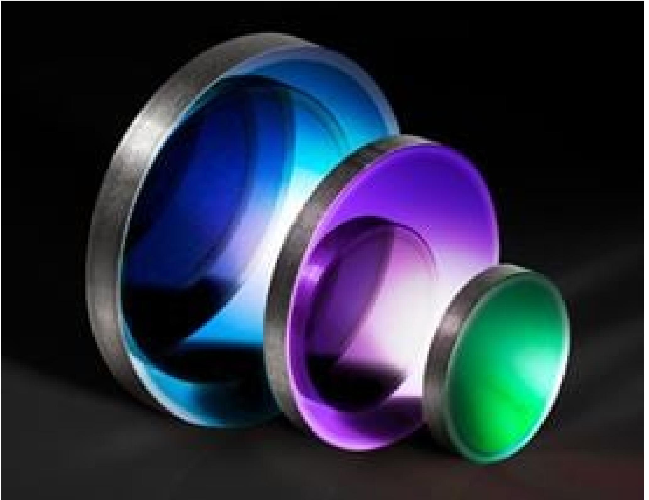
Germanium (Ge) Windows