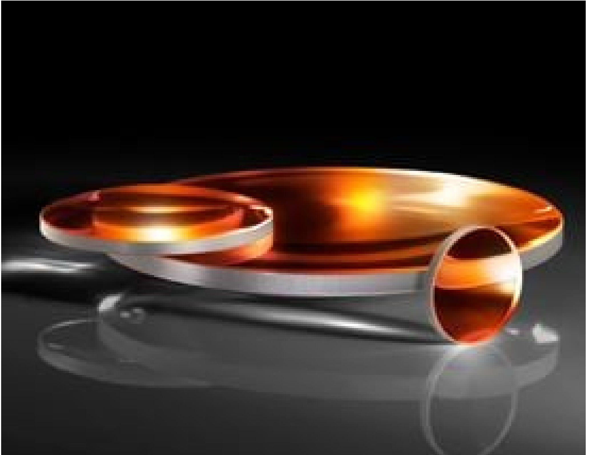
TECHSPEC Calcium Fluoride Plano-Convex (PCX) Lenses