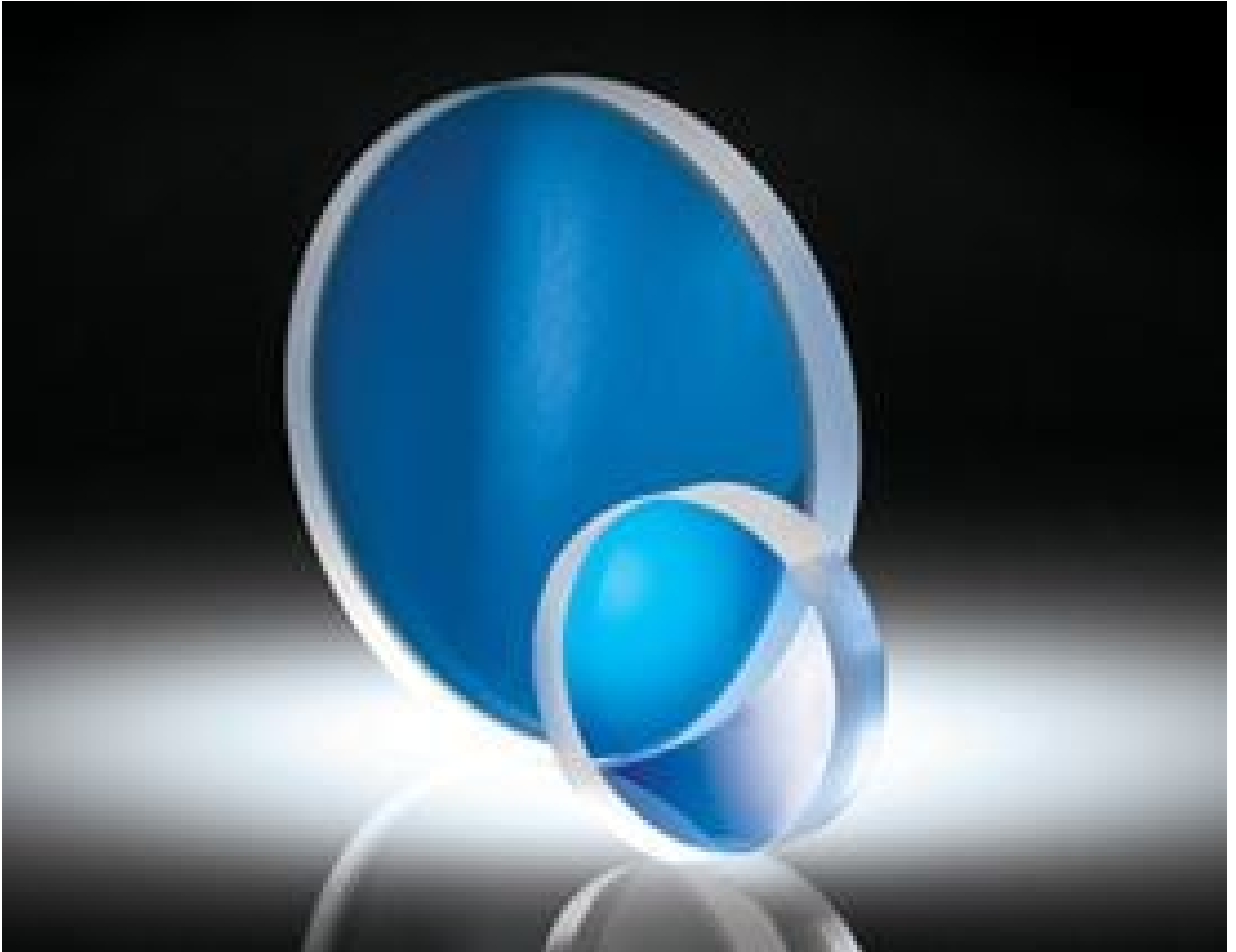
Spherical Aberration Compensation Plates