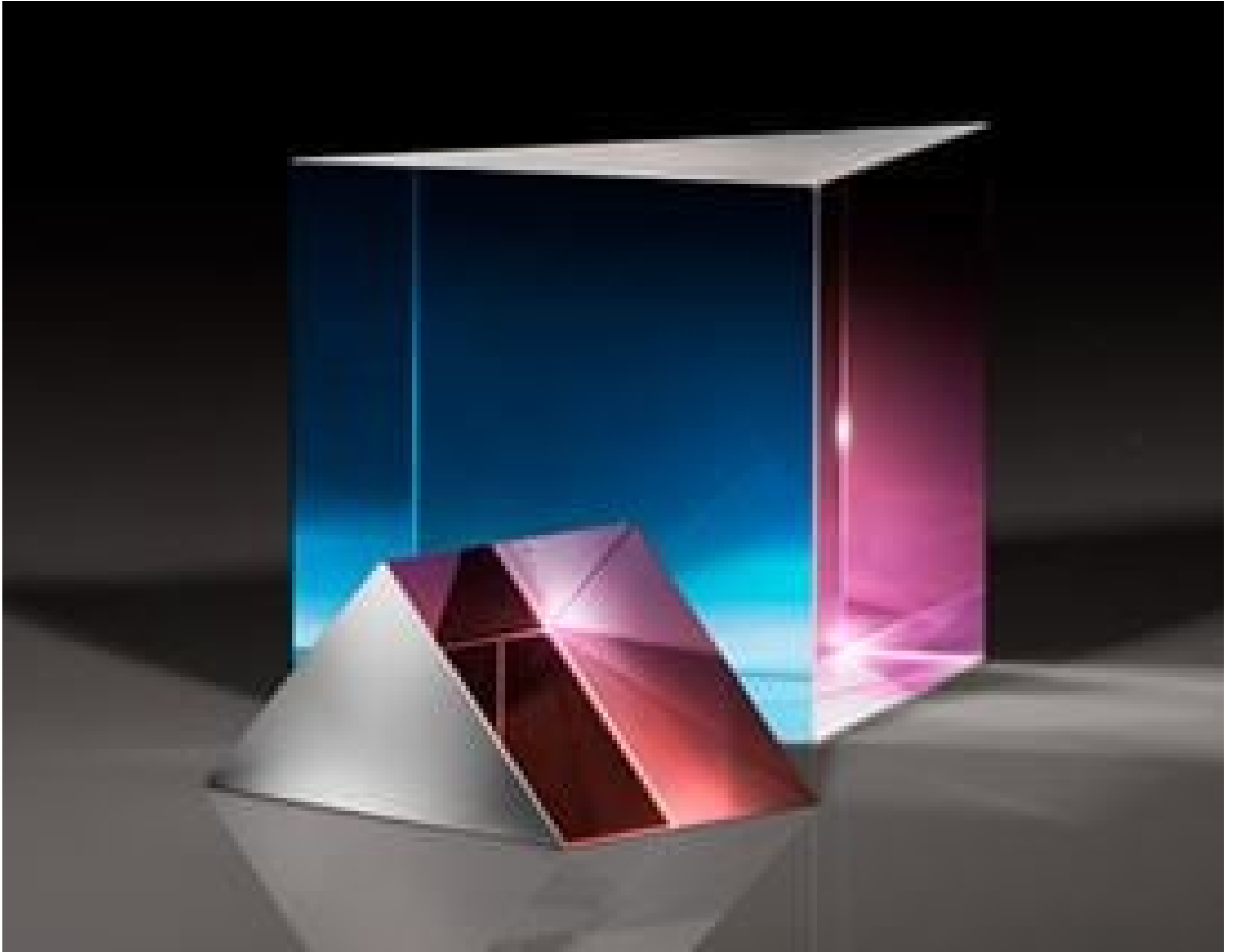
TECHSPEC High Tolerance UV Fused Silica Right Angle Prisms