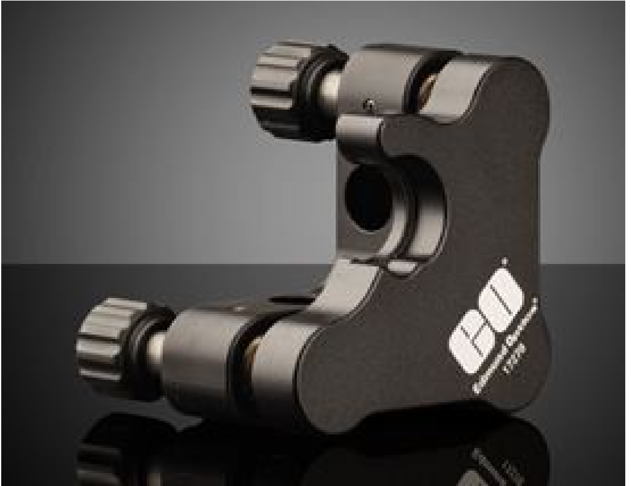
#17-278, 12.5/12.7mm Optic Dia., E-Series Clear Edge Kinematic Mount