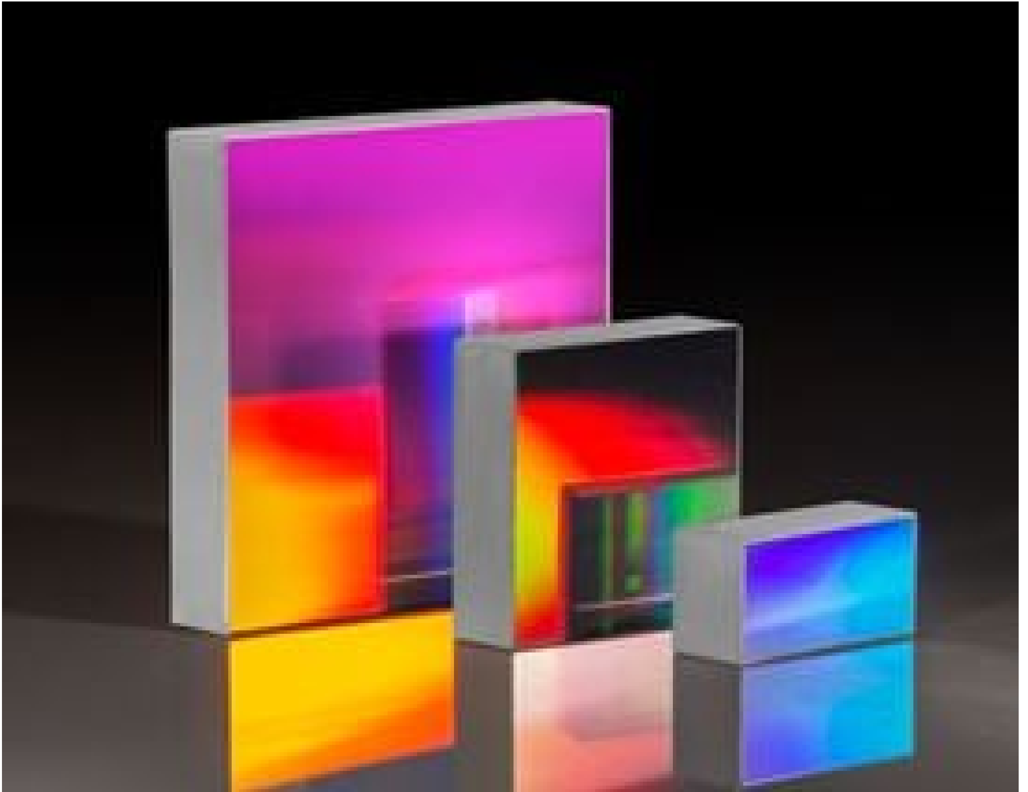
Reflective Ruled Diffraction Gratings