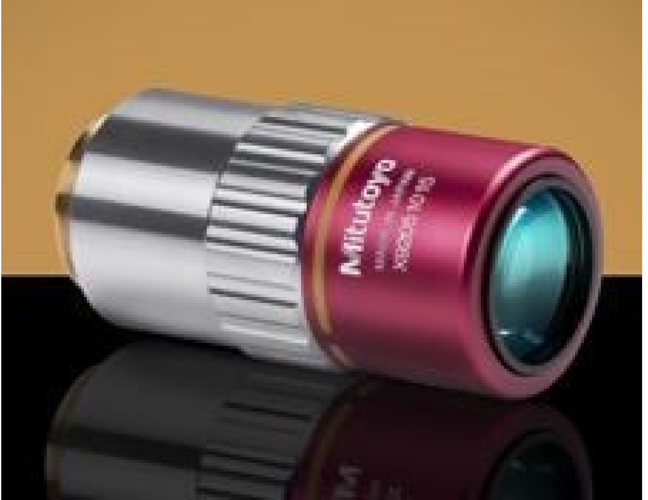
10X Mitutoyo Plan Apo NIR Infinity Corrected Objective, #46-403