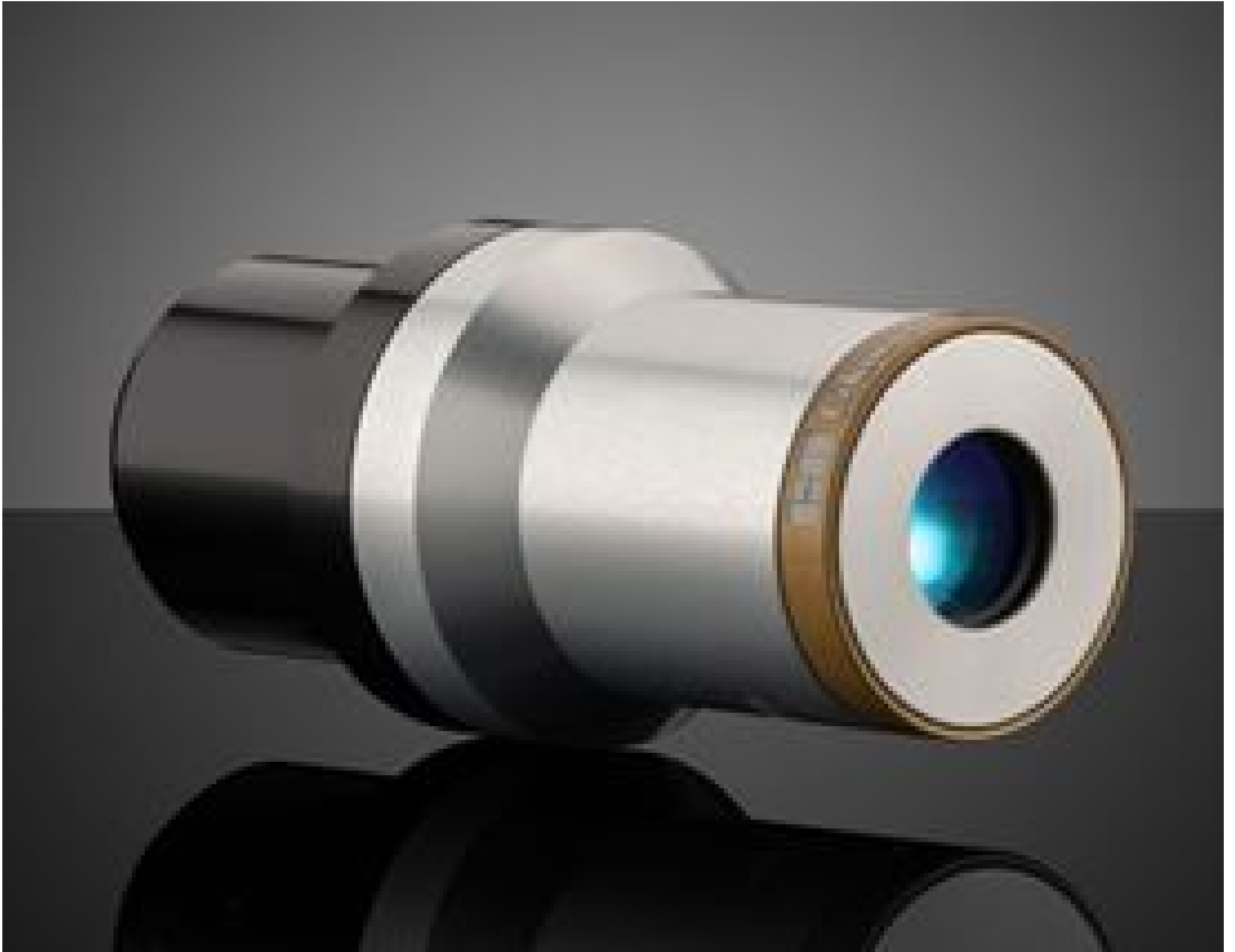
#88-354: 10XCf Objective