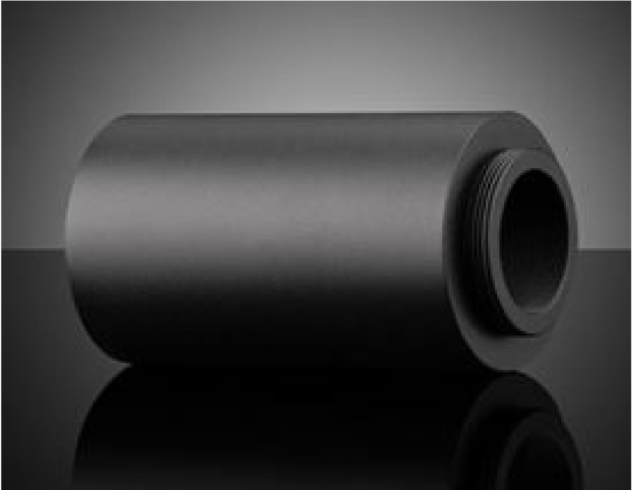
#23-901, 5X, 95mm, C-Mount Parfocal Adapter