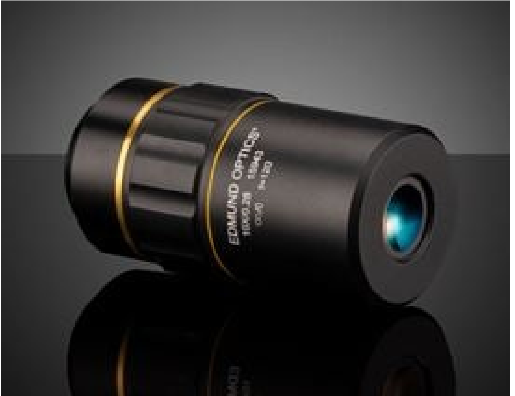
#15-943: 10X 120i Infinity Corrected Objective