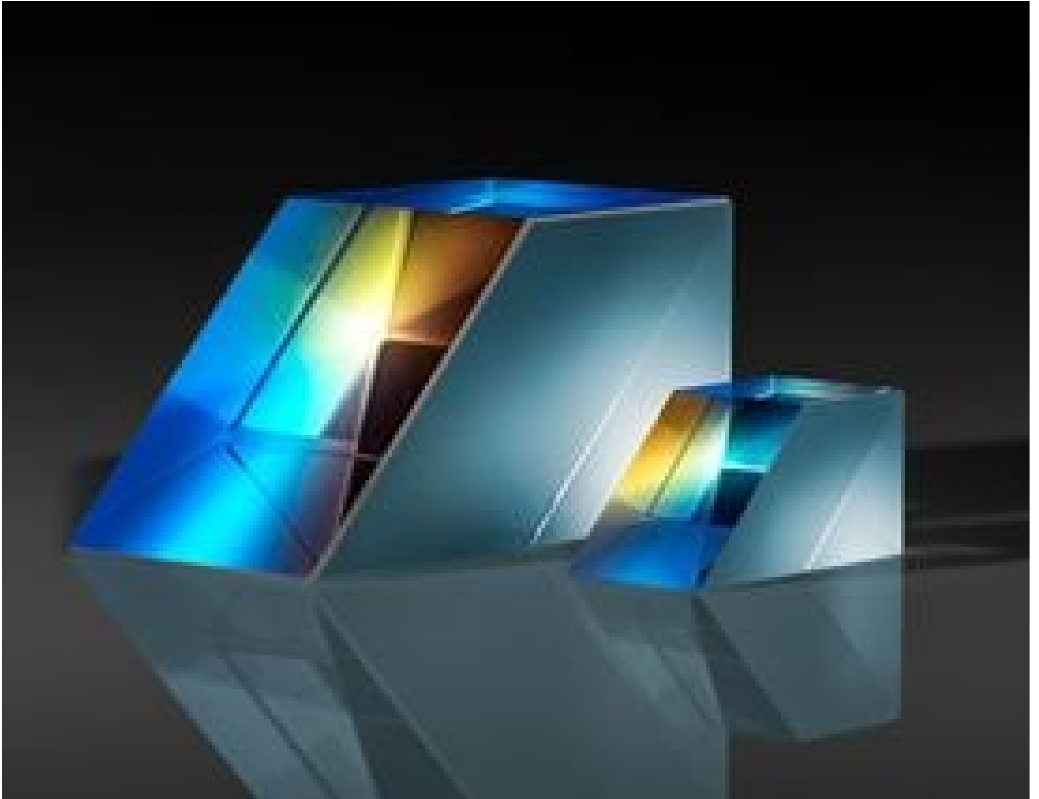
Lateral Displacement Beamsplitters