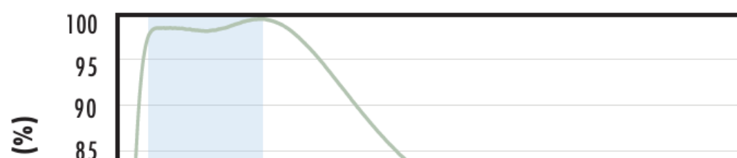
Fused Silica with UV-AR Coating Typical Transmission

Typical transmission of a 3mm thick fused silica window with UV-AR (250-425nm) coating at 0° AOI.