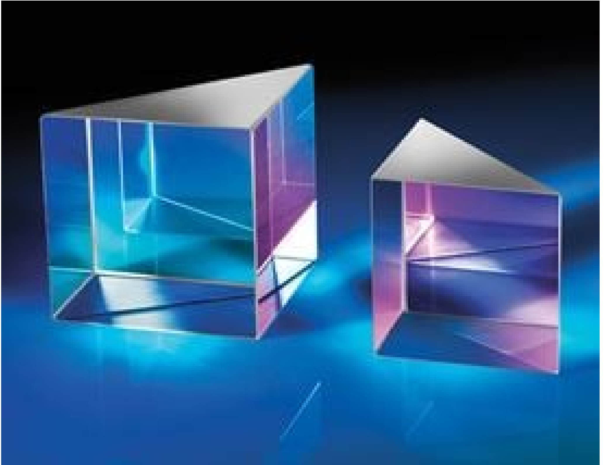
N-BK7 High Tolerance Right Angle Prisms