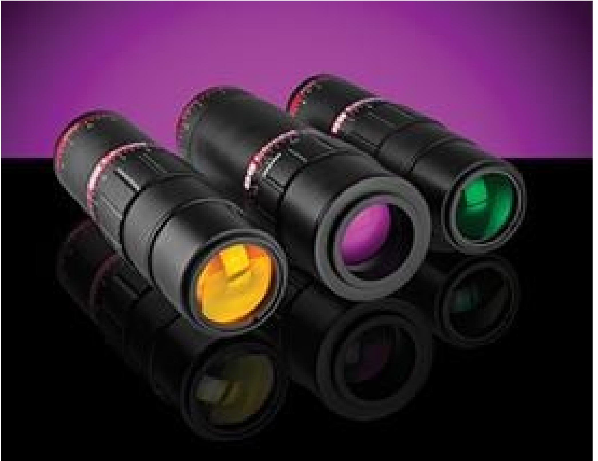
Research-Grade Variable Beam Expanders