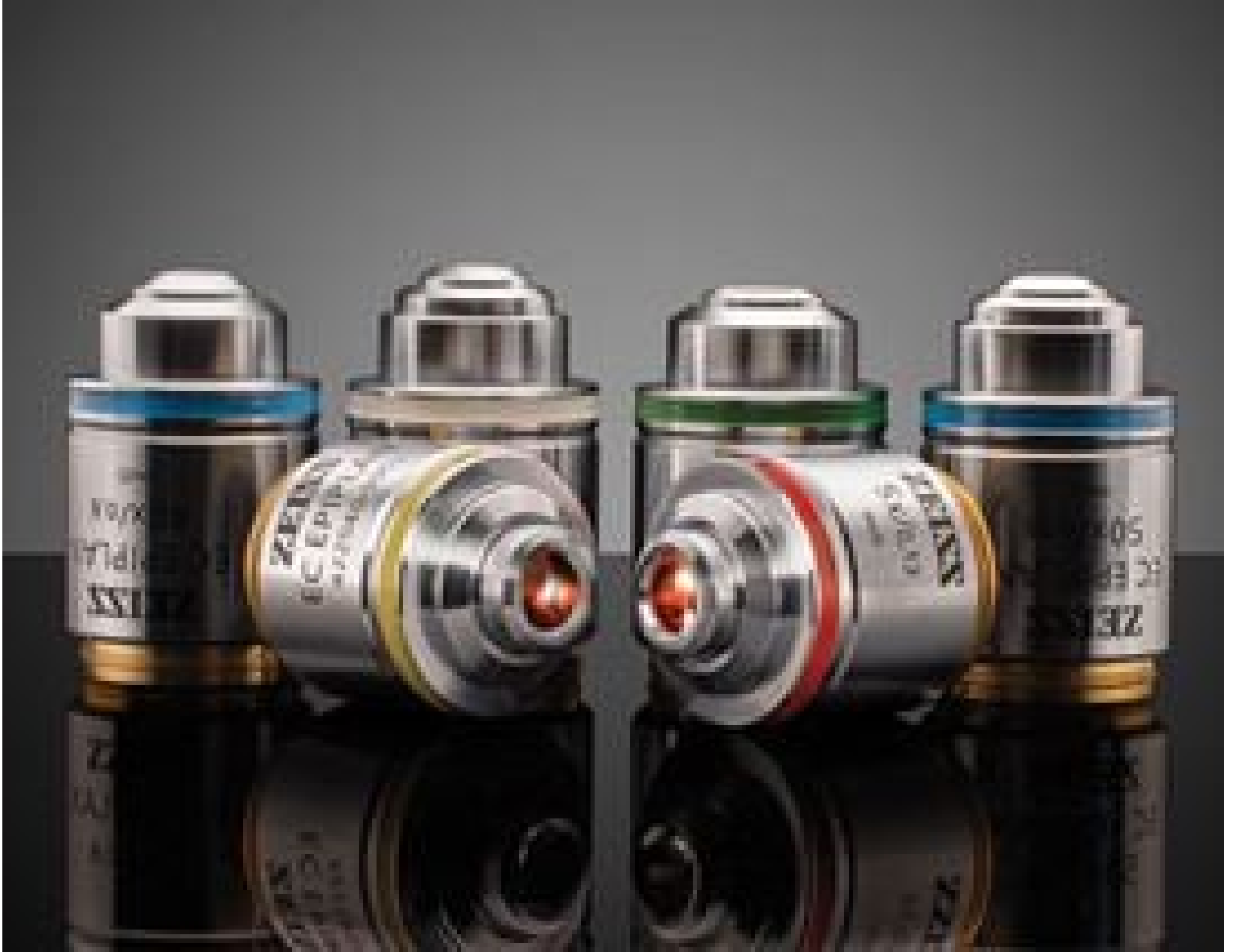
ZEISS EC Epiplan Objectives