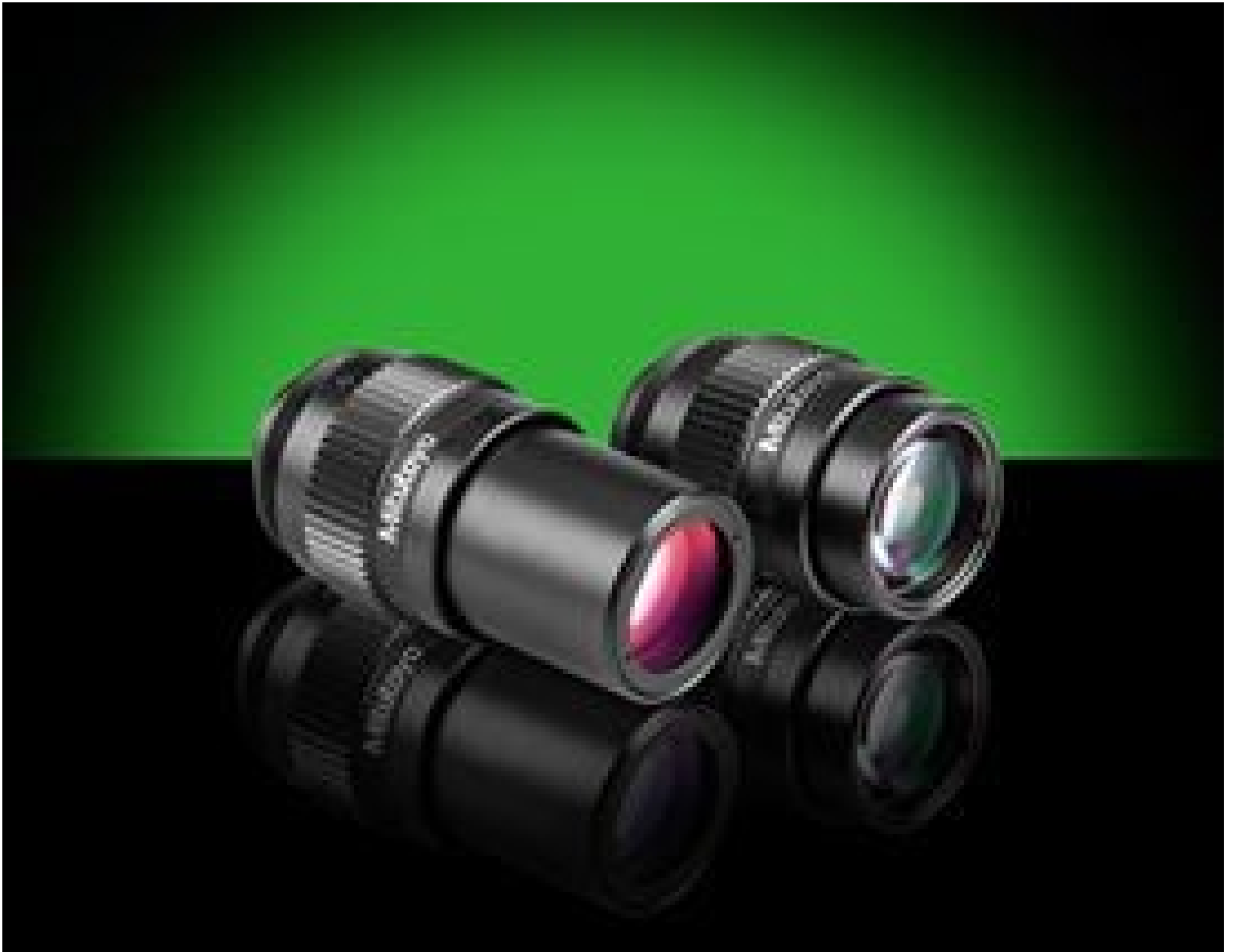
3X (#56-985) & 5X (#56-986)