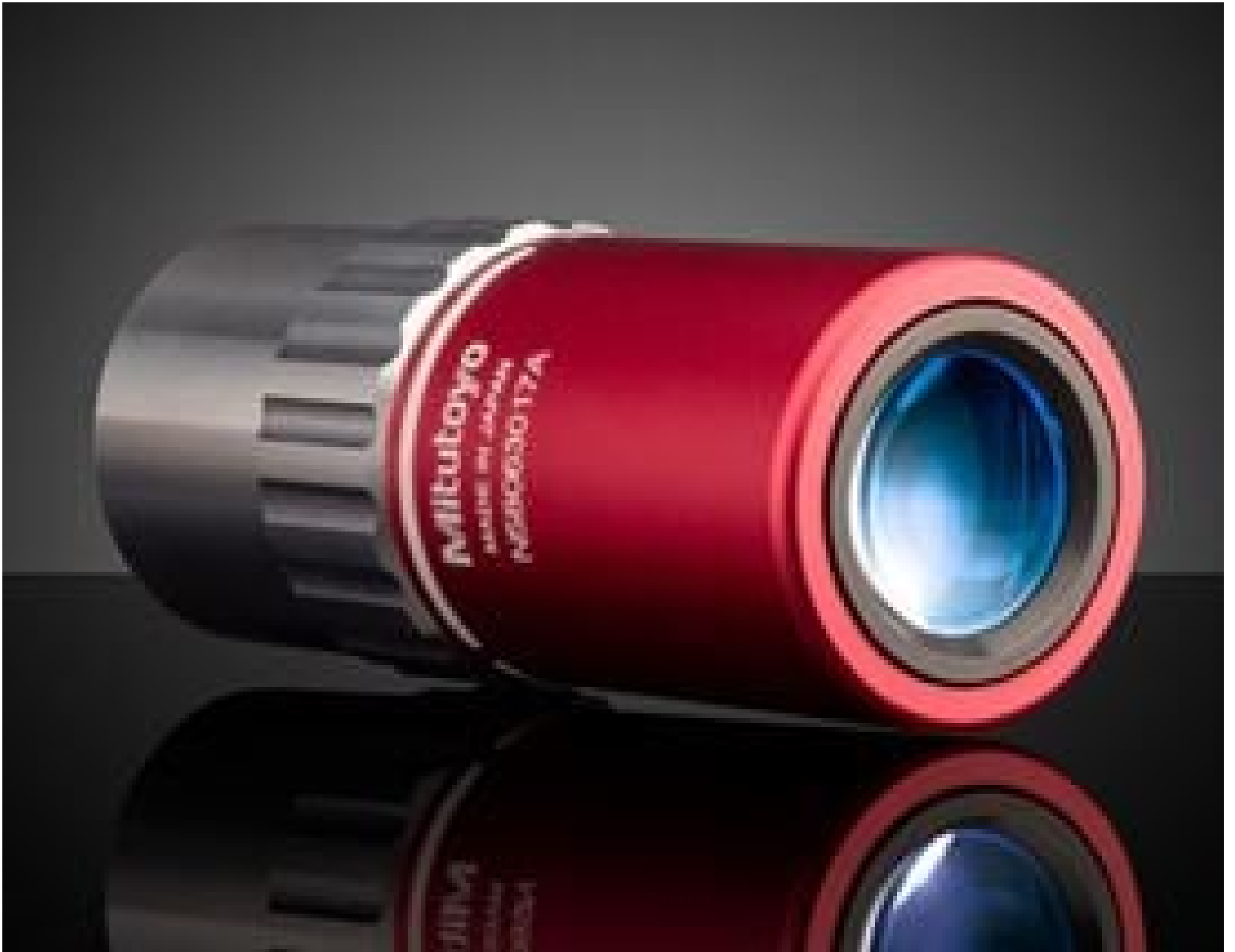
100X Mitutoyo Plan Apo NIR Infinity Corrected Objective, #46-406