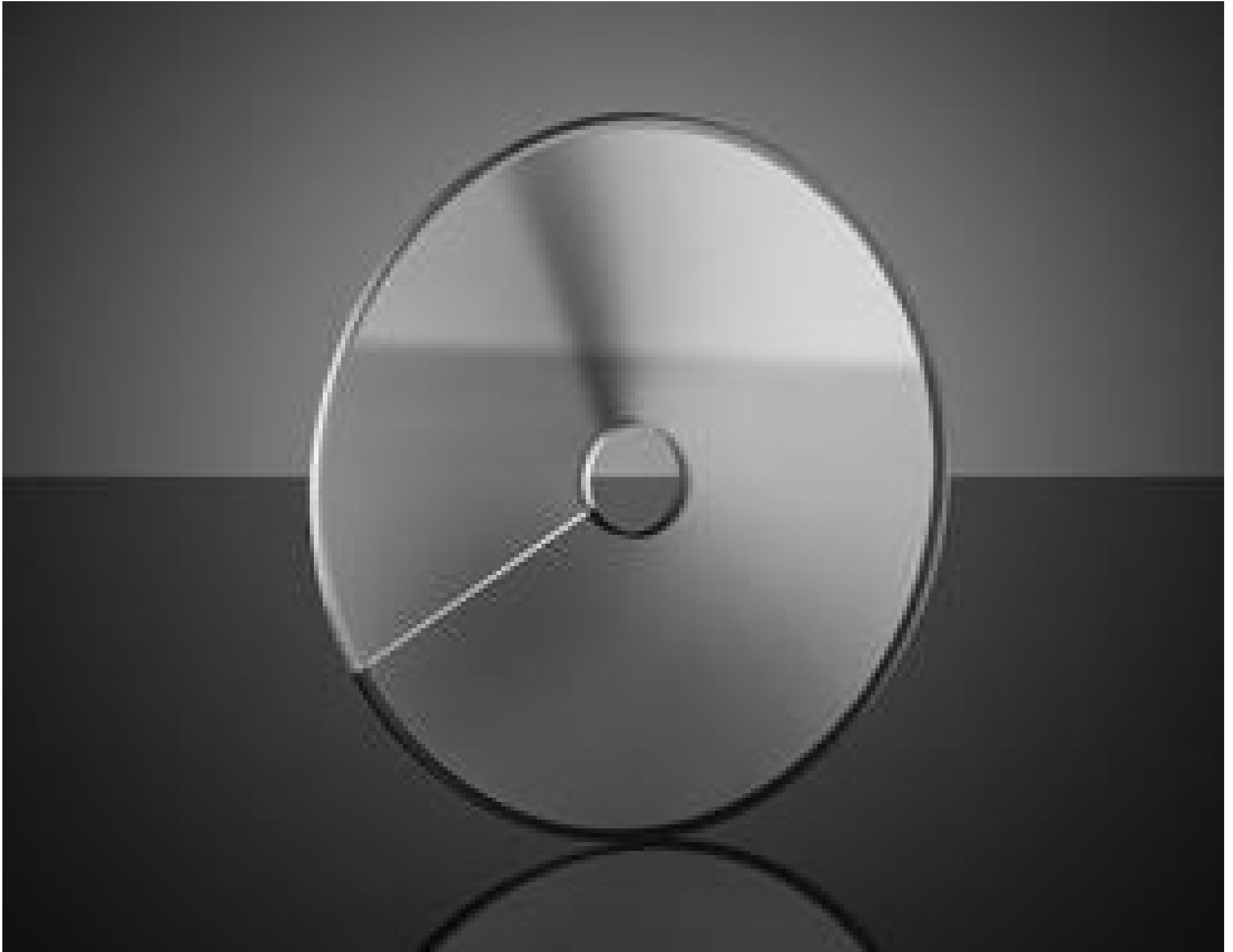
Unmounted Circular Variable Neutral Density (ND) Filters