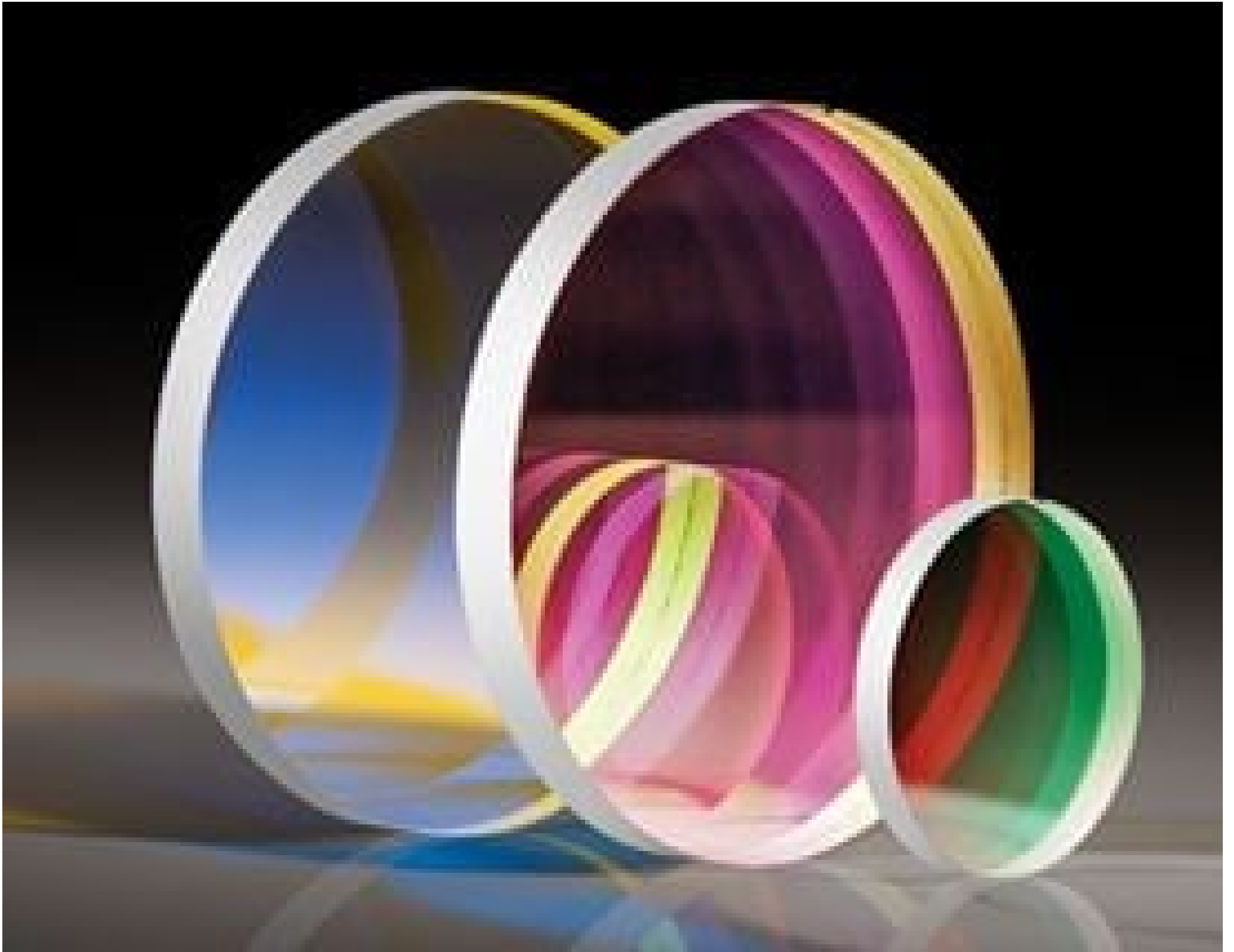
High Performance OD 4.0 Longpass Filters